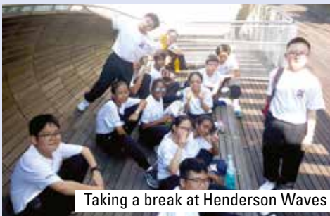
Taking a break at Henderson Waves

On 2 August 2019, the Sec One and Sec Two NPCC cadets went to Mount Faber for a hike. The cadets journeyed four kilometres in sunny weather, visiting the Henderson Waves, Southern Ridges and Hort Park. The Sec Two cadets encouraged and motivated the juniors with sing-along, while the Sec One cadets shared their knowledge of Singapore history. Even though it was their first hike, the cadets enjoyed themselves and had an enriching experience.