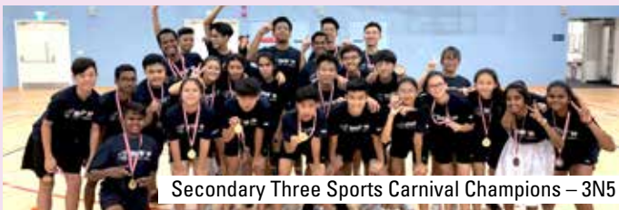
Secondary Three Sports Carnival Champions – 3N5

Congratulations to the 2019 Class Champions, 1E2, 2N6, 3N5 and 4N6!