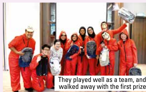
They played well as a team, and walked away with the first prize