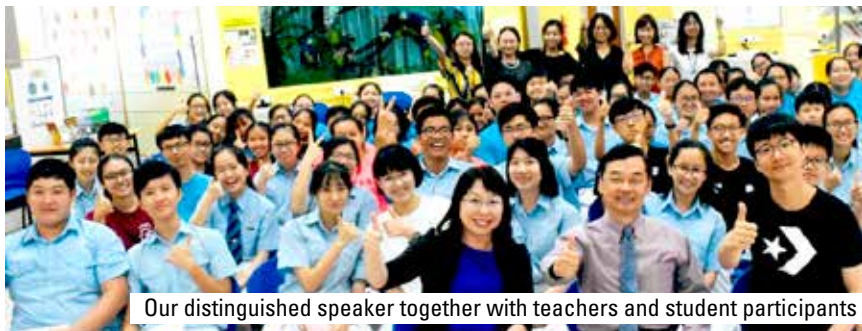
Our distinguished speaker together with teachers and student participants