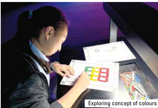
Exploring concept of colours

After the visit, students created their own pinhole viewer to explore how quality images are formed. Many of the students were intrigued by the images they saw on their pinhole viewer. They also discovered how Art and Science complement each other in the real world!