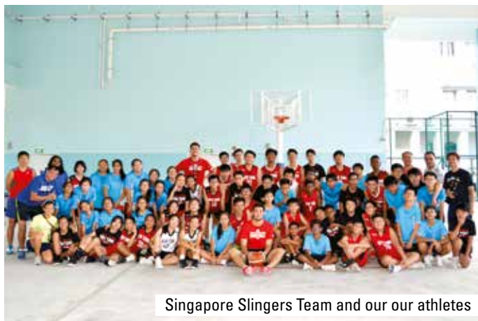
Singapore Slingers Team and our our athletes

With an emphasis on dedication, determination and discipline, our New Town Basketball team believes in unity through diversity. The team trained hard for the National School Games (NSG) West Zone Basketball Championships all year round and went for each match with greater mental and physical resilience. The 'B' Division boys did us proud by qualifying for the second round in the NSG West Zone Games.