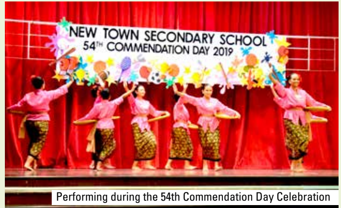
Performing during the 54th Commendation Day Celebration

The Ethnic Fusion Dance achieved the Certificate of Accomplishment in the 2019 Singapore Youth Festival Arts Presentation. This award was made possible by the hard work of the dancers who were committed to do their best in the performance. Most importantly, the dancers learnt the meaning of teamwork and perseverance through the joy of dancing.