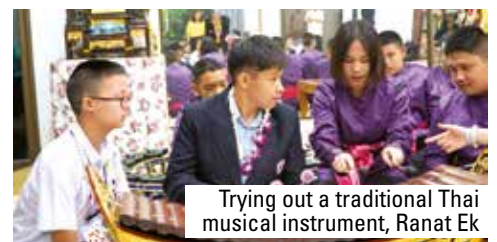
Trying out a traditional Thai musical instrument, Ranat Ek

The Singapore-Thailand Enhanced Partnership 2019 was a memorable experience for our students. The programme started with a camp at Nong Nooch Tropical Garden in Thailand where our students bonded with their Thai buddies and participated in team bonding activities.