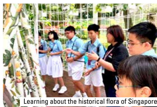
Learning about the historical flora of Singapore

The Singapore Bicentennial marks the 200th anniversary of Singapore's founding by the British. To provide an opportunity to gain a better understanding of our nation's transformation through time, all our Secondary One students were taken on a learning journey to Fort Canning Centre for The Bicentennial Experience on 10 July 2019.