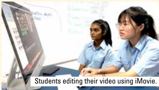
Students editing their video using iMovie.