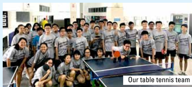
Our table tennis team

The 'B' Division Boys Table Tennis team participated in the West Zone Championships 2019. The boys practised hard and played with resilience. Though the team did not win enough matches to proceed further in the tournament, the boys enjoyed taking up the challenge and building their confidence.