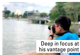
Deep in focus at his vantage point