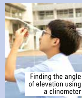
Finding the angle of elevation using a clinometer