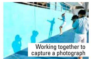
Working together to capture a photograph