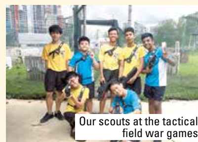
Our scouts at the tactical field war games