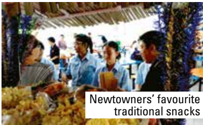
Newtowners' favourite traditional snacks