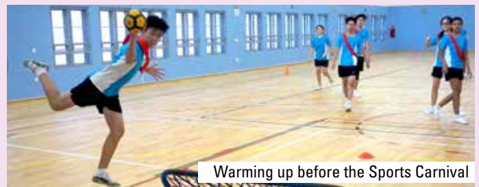
Warming up before the Sports Carnival

Entrenched in an enthusiastic and encouraging culture, our New Town Sports Carnival 2019 promoted sportsmanship and excellence through sports. Valuing friendship over victory, competitive teams were able to manage conflicts and resolve differences with one another. It was heartening to see a strong number of supporters who came with banners to support their peers.