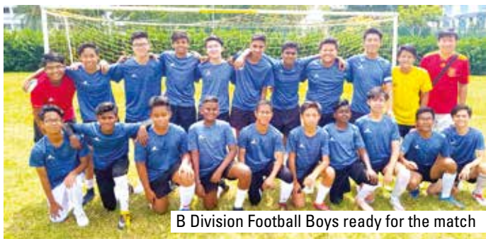
B Division Football Boys ready for the match