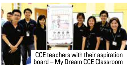
CCE teachers with their aspiration board – My Dream CCE Classroom

In the morning of the same day, the Contemporary Issues Core Team organised a workshop for all teachers on contemporary issues and facilitation in CCE. Focusing on the theme 'Inspiring Our Students to be Citizens of Character,' this is the third workshop for teachers as the school continues its journey in building the capacity of teachers in facilitating discussions with multiple perspectives in the CCE classroom.