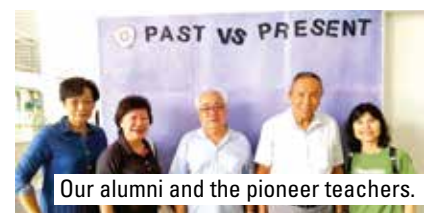
Our alumni and the pioneer teachers.