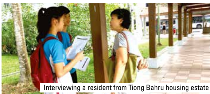
Interviewing a resident from Tiong Bahru housing estate

At the Tiong Bahru Market and in Chinatown, Newtowners explored if common spaces in Singapore were effective in facilitating interactions among people of different backgrounds. Some students visited the Singapore Sports Hub where they learned about the role of sports in building our national identity.