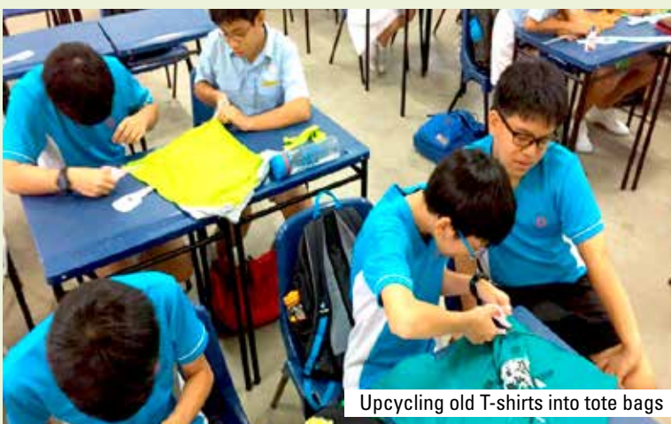
Upcycling old T-shirts into tote bags

The school has made great strides in its greening efforts and this is certainly made possible with the concerted efforts of all staff and students. We will continue with our efforts for environmental improvement both in school and the community at large.