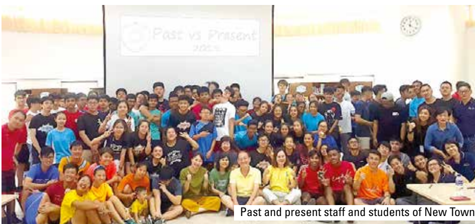
Past and present staff and students of New Town