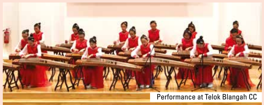
Performance at Telok Blangah CC