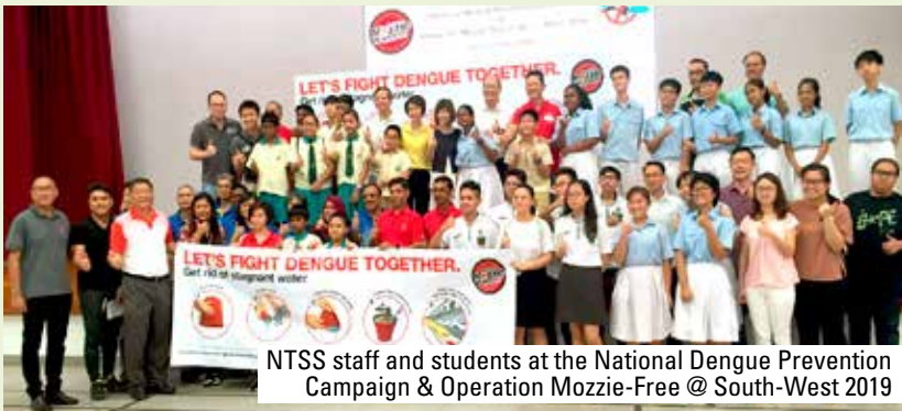
NTSS staff and students at the National Dengue Prevention Campaign & Operation Mozzie-Free @ South-West 2019

Since the establishment of Environment Education as one of the school's signature programmes in 2005, going green has become an integral part of our daily life. To achieve a green environment, the school uses eco-friendly products such as printing paper with the Green Label and refillable whiteboard markers. Energy saving light bulbs and water saving devices are also installed. Posters on energy conservation and reduction of food wastage are displayed around the school campus. Besides the school's recycling corner, many collection points are set up with food waste bins, paper recycling boxes and tetrapak recycling bins.