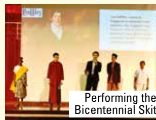
Performing the Bicentennial Skit

Our school celebration then climaxed with the singalong session which showcased our school's passion towards Singapore.