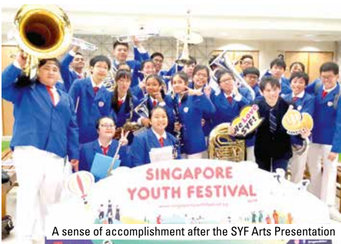
A sense of accomplishment after the SYF Arts Presentation