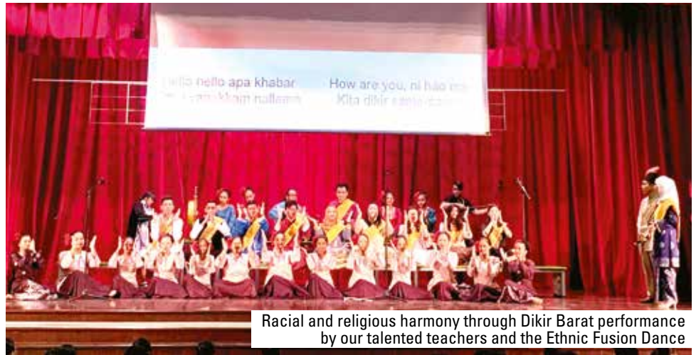
Racial and religious harmony through Dikir Barat performance by our talented teachers and the Ethnic Fusion Dance

Our school commemorated Racial Harmony Day (RHD) on 17 July 2019. This year's theme was "The Singapore Connection". Since Singapore was founded in 1819, our immigrant community has tapped on the strengths of our differences to make Singapore everyone's home. During our morning assembly, some teachers and students shared why RHD is celebrated in Singapore and how we can continue to preserve racial harmony.