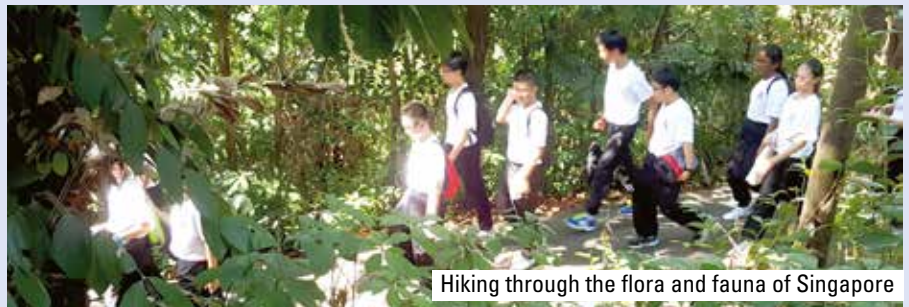
Hiking through the flora and fauna of Singapore