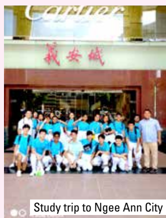
Study trip to Ngee Ann City