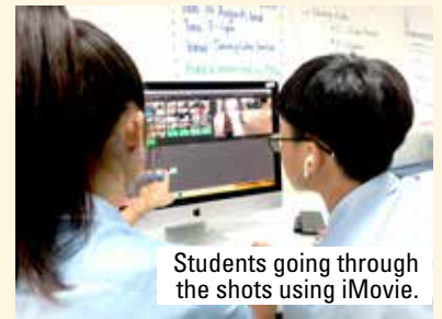
Students going through the shots using iMovie.

Our Enhanced Art Programme students had the opportunity to learn from our alumnus and pathfinder, Mr Melvyn Goh, during the Term 3 segment of our masterclass. The students were introduced to storytelling through moving images. They learnt to plan and frame their shots, film using their own mobile devices and edit videos on iMovie.