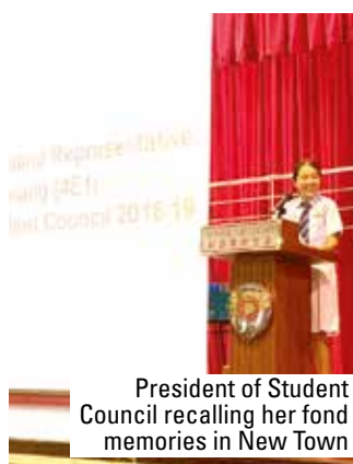
President of Student Council recalling her fond memories in New Town