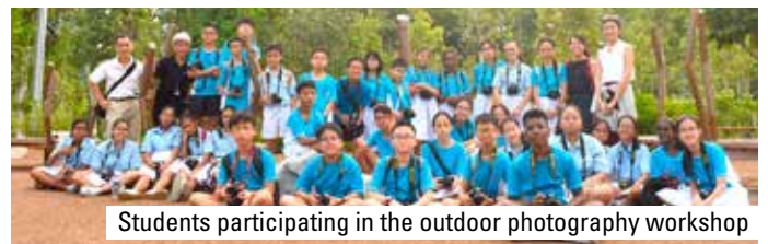
Students participating in the outdoor photography workshop

It is a common sight to see our Secondary One students going around the school, clicking away on their cameras during Art lessons in Term 3. These lessons on basic camera handling and composition techniques are part of the Applied Learning Programme in Visual Communication. During these sessions, students explore different camera settings to produce a good photograph and learn how to frame a photograph to captivate the audience. Our Newtowners are certainly an artistic bunch as many creative shots were captured during the lessons. To further hone their visual communication, some students participated in an outdoor photography shoot at Jurong Lake Garden on 14 August 2019. Through this session, they were able to effectively apply the skills they have learnt.