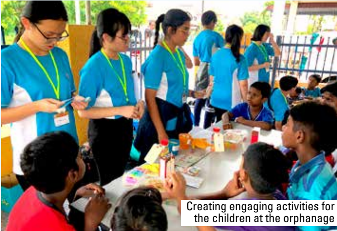
Creating engaging activities for the children at the orphanage