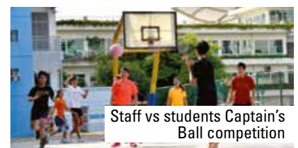
Staff vs students Captain's Ball competition

The Past vs Present Games is an annual event where our New Town Alumni and current students come together to compete in a friendly competition through sports and activities. Many of our alumni came back specially to meet their former teachers and also to catch up with one another.