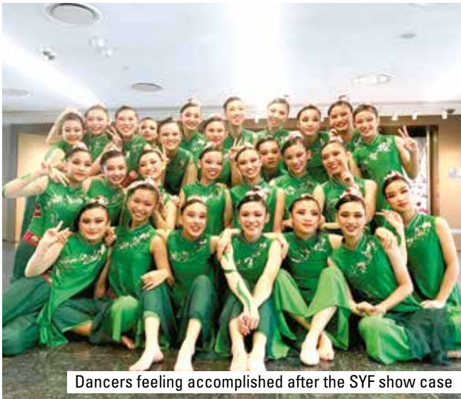
Dancers feeling accomplished after the SYF show case

Our dancers participated in the Singapore Youth Festival Arts (SYF) presentation on 18th April 2019 and achieved a Certificate of Distinction. The dance combined traditional Chinese dance movements with contemporary music and SYF presentation was an excellent platform for our dancers to share their talents and passion with the audience and judges. This enriching journey has moulded the dancers to stay united and motivated, strive for excellence and enjoy themselves on stage. The students will always dearly treasure these memories.