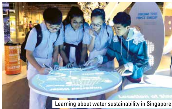
Learning about water sustainability in Singapore

A group of students found out more about Singapore's endeavours in continuing education from the Institute of Lifelong Learning, while another group visited the Sustainable Singapore Gallery to learn about Singapore's sustainability efforts.