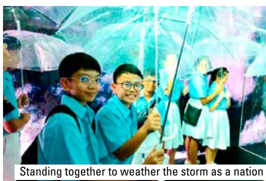
Standing together to weather the storm as a nation