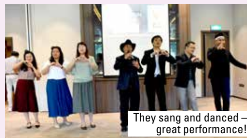
They sang and danced – great performance!

NTSS celebrated Teachers' Day on 5 September 2019 with a concert where students put up performances to show their appreciation for all staff.