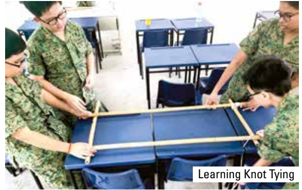
Learning Knot Tying

In July 2019, our Secondary Two NCC cadets invited Nan Hua High and NUS High School cadets to our school for a cluster training session. Our cadets had a chance to lead and teach the skill of knot tying to cadets from other schools. They would be able to apply the skill in future to build simple structures which are essential for jungle survival.