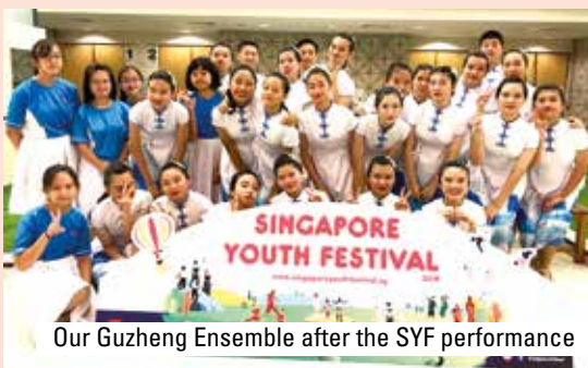
Our Guzheng Ensemble after the SYF performance

This year was an important milestone for the students as they have achieved the Certificate of Distinction at the Singapore Youth Festival Arts (SYF) Presentation. The ensemble accomplished Distinction for two consecutive SYF Presentations. This meaningful experience has enabled the Guzheng Ensemble to work as a team. The memories made will be treasured by the students even after graduating from New Town.