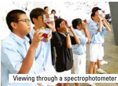
Viewing through a spectrophotometer

In May 2019, the Science and Art teachers collaborated to design a hands-on learning experience for the Sec One NA students. Students visited the ArtScience museum where they acquired knowledge about light and colours through a series of engaging activities.