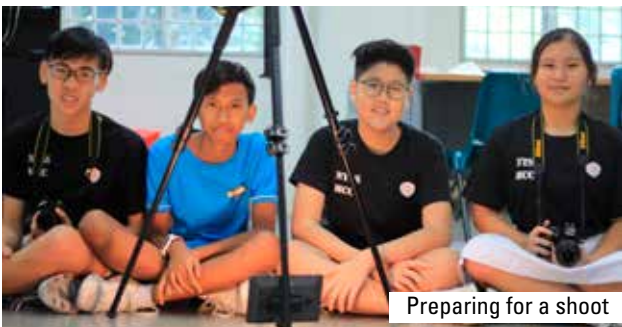
Preparing for a shoot

It was a fruitful year for the Media and Communications Club as the members participated in a myriad of competitions and provided audio visual, photography and videography support for various school events. The students participated in 'Our Schools Our Stories' contest, capturing memorable moments in our school, and 'SG75: Our Singapore Competition', producing two videos which expressed their vision and hope for Singapore.