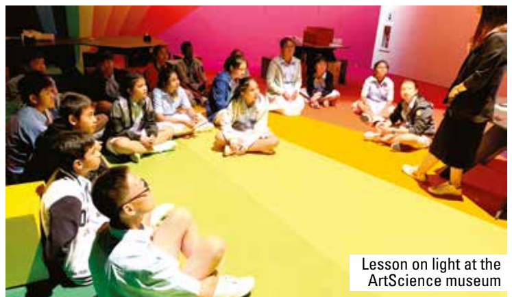
Lesson on light at the ArtScience museum