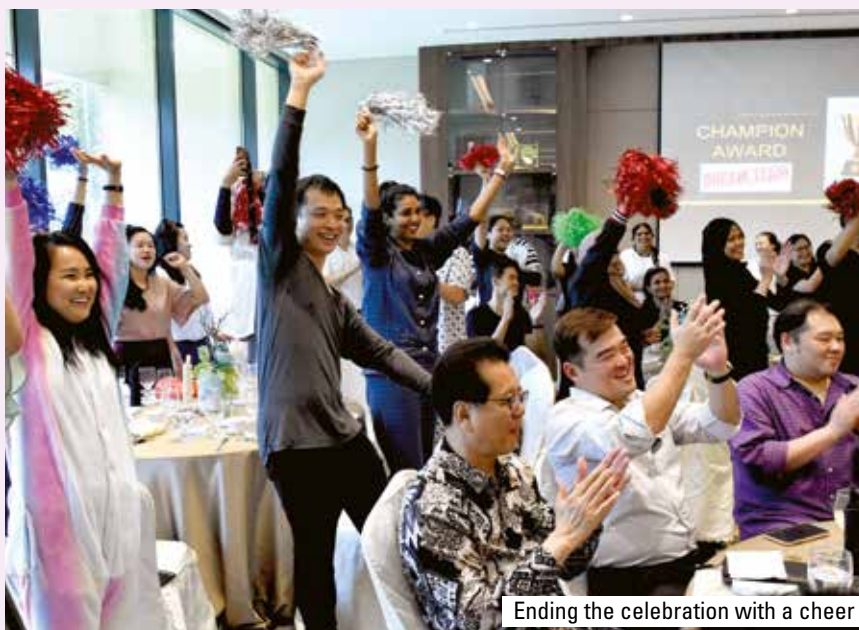
Ending the celebration with a cheer