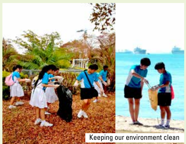
Keeping our environment clean