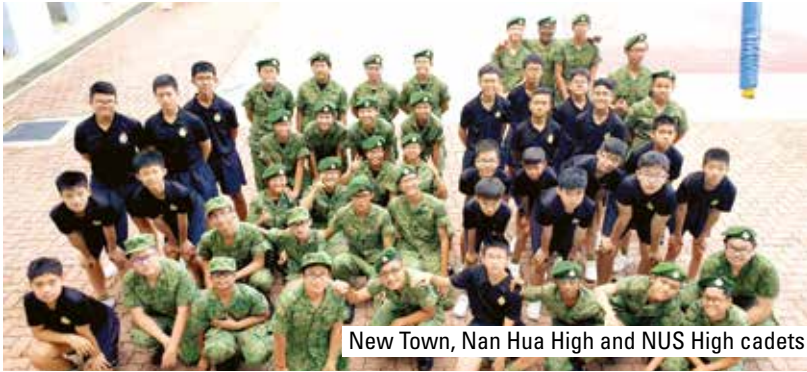
New Town, Nan Hua High and NUS High cadets