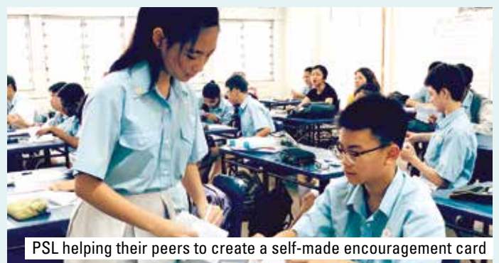
PSL helping their peers to create a self-made encouragement card

During the stressful pre-examination period, the PSLs created a small self-made booklet to allow classmates to write encouraging notes to each other. Students were excited and heartened to receive a positive note of encouragement from their friends.