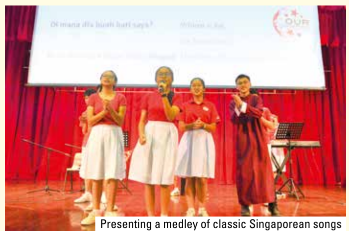
Presenting a medley of classic Singaporean songs