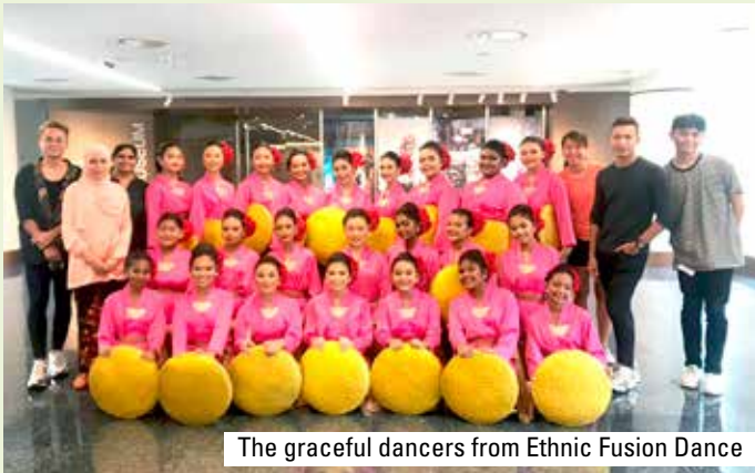
The graceful dancers from Ethnic Fusion Dance