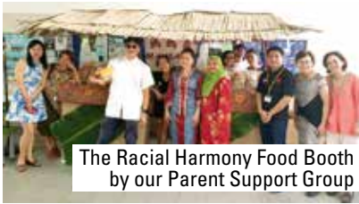
The Racial Harmony Food Booth by our Parent Support Group