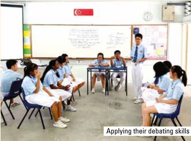
Applying their debating skills

Over a span of three sessions, our Secondary Three students were introduced to debating skills where they learnt how to build a persuasive case using a framework. They gained a deeper understanding of good presentation skills and set forth to work in groups for the intra-class debates. Finally the inter-class debate competition saw the winning team from each class pitting against one another in a battle of reasons and persuasions.