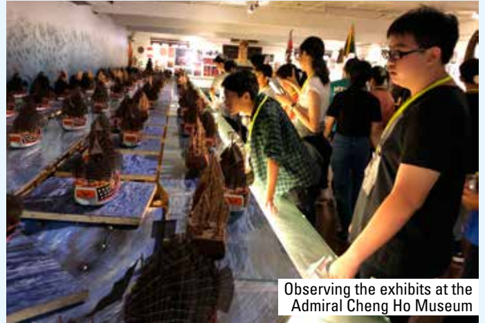
Observing the exhibits at the Admiral Cheng Ho Museum

Our Secondary Two students were involved in a Values In Action (VIA) and educational trip to Malacca during the September school holidays.