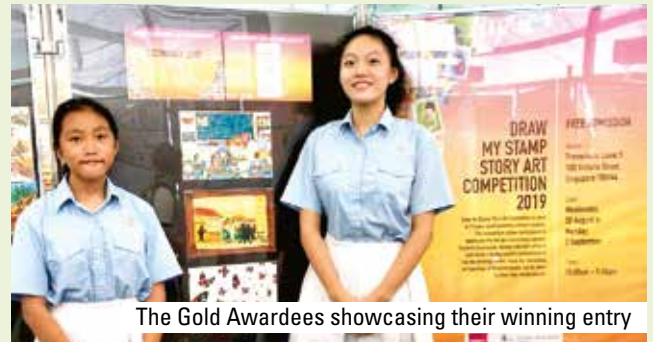
The Gold Awardees showcasing their winning entry

The Art Club organised an Inter-level Painting Competition for its members, allowing them to experiment with the creation of artwork on a canvas tote bag. Some of our Manga club members embarked on a digital Manga workshop and learned about illustration and shading of Manga characters using the iPad.