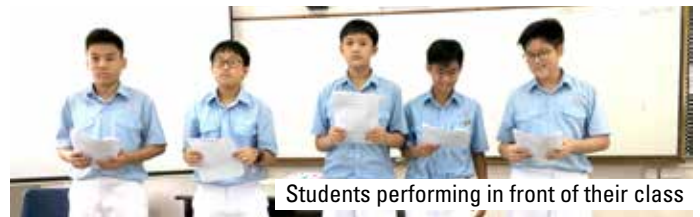
Students performing in front of their class