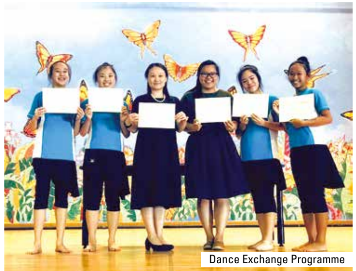
Dance Exchange Programme