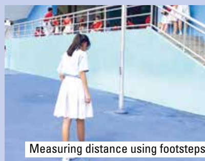
Measuring distance using footsteps

The students enjoyed making the clinometers and were excited using their self-made instrument for real-life needs.