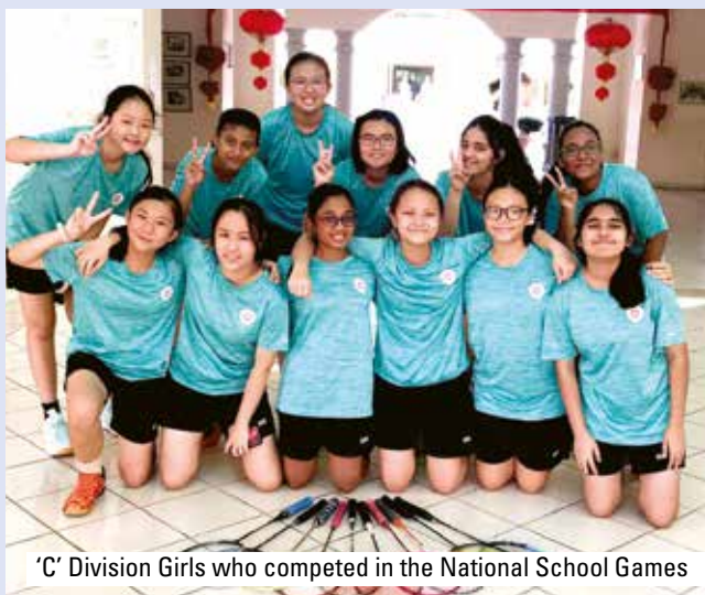
'C' Division Girls who competed in the National School Games

Our students played against many strong and skilful opponents in the West Zone. Although most members of the team were new to the sport and started playing badminton competitively only after joining the CCA, they exhibited sportsmanship in every match that they played.