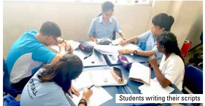
Students writing their scripts

The programme focussed on character analysis, script writing as well as oral presentation techniques. The goal was to bring texts alive by using a clear voice and facial expressions. The sessions enabled our students to become more confident speakers.