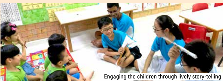
Engaging the children through lively story-telling

Members of the Creative Readers Club visited pre-school children at the YMCA Child Development Centre @Bukit Batok in July 2019 to read popular stories to the children. Our students captivated the young audience with their lively story-telling and animated dramatisation. It was an enriching experience for the members and they look forward to more story telling sessions.