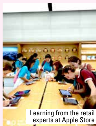
Learning from the retail experts at Apple Store

During the June school holidays, Secondary Three students participated in a customised Business and Finance Elective Module, designed to help them explore possible future career paths. The three-day workshop helped participants gain basic business principles and practise practical retailing skills. To help students connect theoretical knowledge to real-life application, a half-day learning journey to several retail outlets at Orchard Road was conducted.