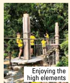
Enjoying the high elements

Our New Town scouts visited the residents at Buona Vista and Clementi HDB flats to explain how to prevent dengue mosquitoes breeding at home. The scouts also offered their services to the residents and carried out their Jobweek activities earnestly.