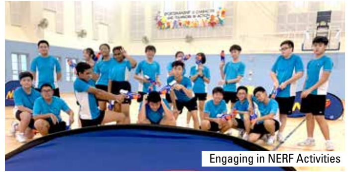
Engaging in NERF Activities

The students reflected and shared their key learning points, showing appreciation for their peers and teachers.