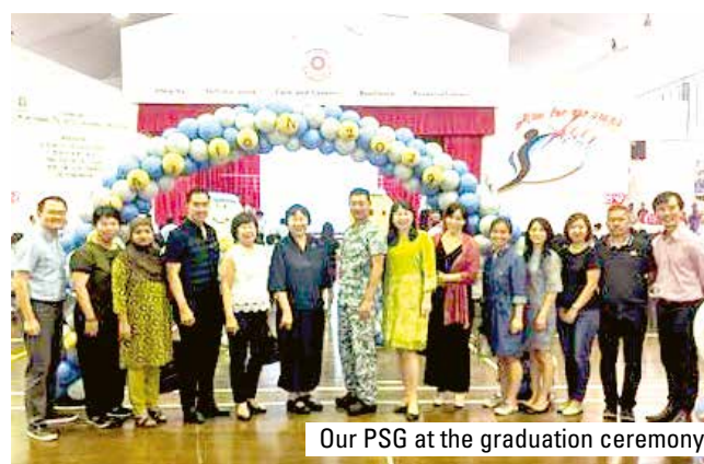
Our PSG at the graduation ceremony