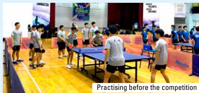
Practising before the competition