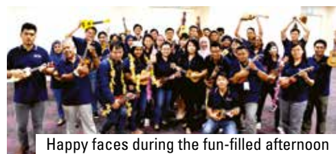
Happy faces during the fun-filled afternoon