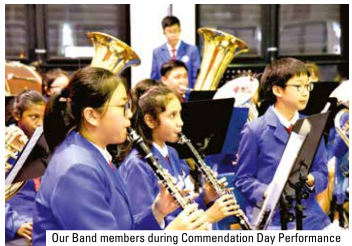
Our Band members during Commendation Day Performance

It was a fulfilling and memorable year for our musicians as they were exposed to various performances during school events. These include the CCA Open House and our 54th School Commendation Day. The students had a one-day camp in June 2019 where bonding and great friendship was fostered. Some of our members performed at the Yong Siew Toh Conservatory of Music-NUS during the Band Directors' Association Adventure Band Camp.