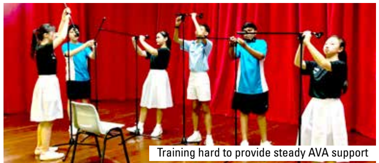
Training hard to provide steady AVA support