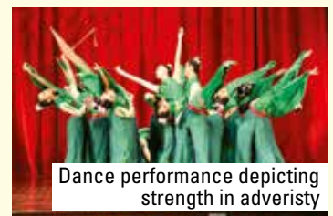
Dance performance depicting strength in adversity