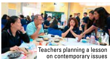
Teachers planning a lesson on contemporary issues