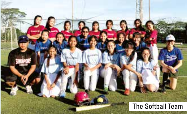
The Softball Team

Softball is an intensive sport that inculcates core values such as respect, responsibility and discipline. It builds up character, teamwork, skills and fitness in the players.