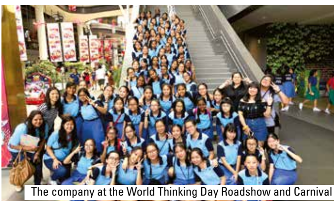
The company at the World Thinking Day Roadshow and Carnival

Upholding the 'Guiding Spirit', the Girl Guides contributed to the success of the World Thinking Day Roadshow and Carnival. The annual camp activities also saw the girls strengthening their resilience. During the West Division Day, our Unit conducted an interactive game session and achieved the Gold award. The girls also led campfire games during the West Division Campfire. All these activities helped to hone self-confidence in the girls.