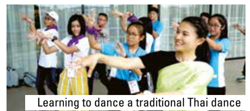
Learning to dance a traditional Thai dance