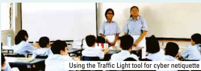
Using the Traffic Light tool for cyber netiquette

The PSLs took the lead in rallying our students to promote good cyberspace netiquette through various activities. The PSLs used the Traffic Light tool to encourage peers to Stop (red) unsafe practices, Consider (amber) consequences before posting and Start (green) positive initiatives in cyber netiquette.