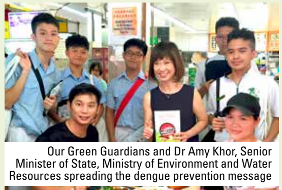
Our Green Guardians and Dr Amy Khor, Senior Minister of State, Ministry of Environment and Water Resources spreading the dengue prevention message

The school provides a values-based education on environmental issues in the Humanities and Science curriculum. Class discussions centre on energy conservation as well as efforts in combating climate change, saving the trees and minimising food wastage. Student learning is further enhanced through their Project Work and Values-In-Action programme where they are empowered to research on a given environmental issue and share their findings with the community.