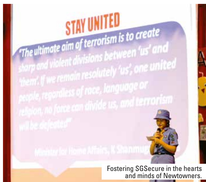
Fostering SGSecure in the hearts and minds of Newtowners.

At the school level, the NE Ambassadors promote citizenship values by sharing their personal experiences during the Morning Inspiration segments on Thursdays. During the assembly programme on the NE Commemoration Day, the NE Ambassadors shared their Co-Curricular Activities (CCA) journeys in equipping them with life skills and they called out to all to stay strong and united to defend Singapore. In addition, the NE Ambassadors also garnered the support of their schoolmates to perform during the assembly programme to celebrate the harmony and diversity in Singapore.