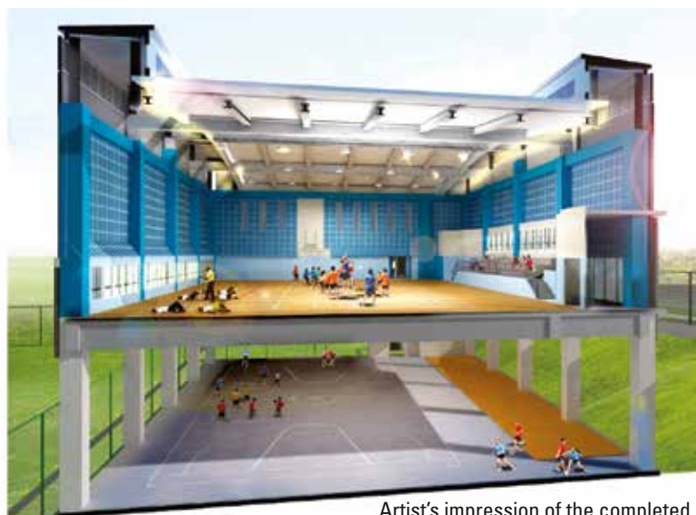
Artist's impression of the completed ISH.

The school started on the construction of a two-storey Indoor Sports Hall (ISH) with a seating gallery in May 2017 and it is expected to be completed by December 2018. The support from the Ministry of Education to construct the ISH will allow the school to broaden the Co-Curricular Activities (CCA) experience and encourage sporting excellence by having more students take up competitive sports in their CCAs. It will also encourage greater mass participation in rugged activities by students who are not involved in competitive sports. The students and staff are looking forward to having this added facility to enhance their school experience.