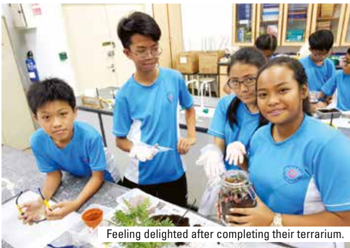
Feeling delighted after completing their terrarium.