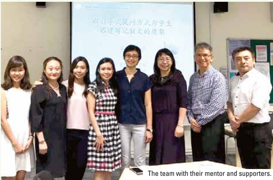
The team with their mentor and supporters.