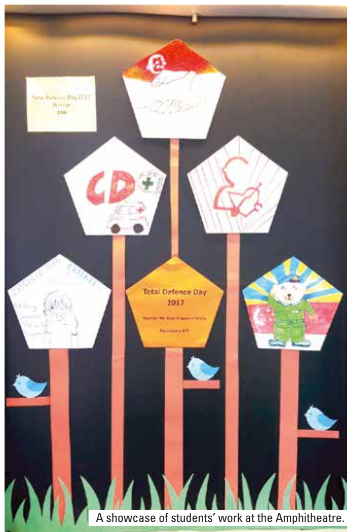
A showcase of students' work at the Amphitheatre.

At the cluster level, the NE Ambassadors and a group of Newtowners mentored and guided students from Yuhua Primary School in their Racial Harmony Day (RHD) projects and oral presentation skills. These concerted efforts brought about a successful RHD Carnival at Yuhua Primary School on 21 July.