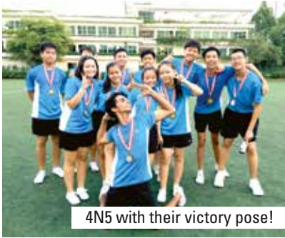
4N5 with their victory pose!