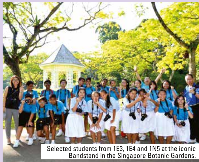
Selected students from 1E3, 1E4 and 1N5 at the iconic Bandstand in the Singapore Botanic Gardens.

43 Secondary One students visited the Singapore Botanic Gardens on 23 August to explore the role that light plays in outdoor photography and further hone the skills learnt during their Art lessons.