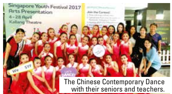
The Chinese Contemporary Dance with their seniors and teachers.