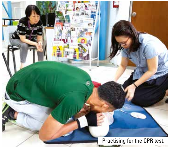
Practising for the CPR test.

The school believes in equipping the staff with skills to deal with emergency situations. Nineteen staff attended a two-day First Aid Training, where they refreshed their knowledge and techniques. At the end of the training, all the participants were certified in Standard First Aid, Cardiopulmonary Resuscitation (CPR) and Automated External Defibrillators (AED).