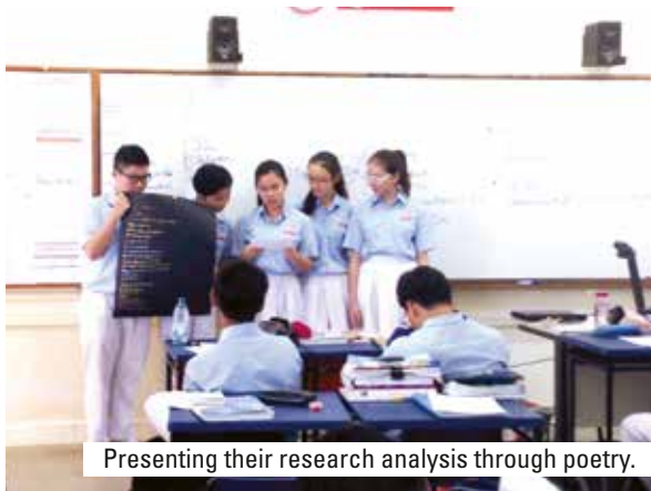
Presenting their research analysis through poetry.

In addition, the Social Studies teachers delve into the use of alternative mediums to bring across important learning points for the students. For example, the students have been tasked to present their opinions in the form of a cartoon which would allow them to develop a personal and affective connection with difficult concepts.