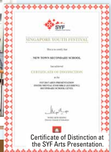
Certificate of Distinction at the SYF Arts Presentation.