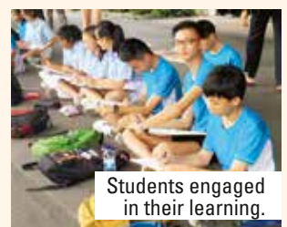
Students engaged in their learning.