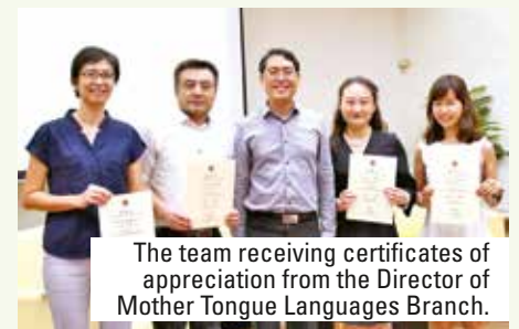
The team receiving certificates of appreciation from the Director of Mother Tongue Languages Branch.