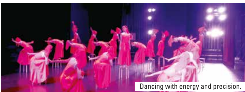
Dancing with energy and precision.

The Chinese Contemporary Dance participated in the Singapore Youth Festival Arts Presentation on 12 April and achieved a Certificate of Accomplishment. The dance, Women , portrays the intricate feelings and internal struggles of a woman who is getting married. The students spent six months practicing three times weekly to prepare for the performance, exemplifying the school values of self-discipline and resilience. They even assembled the chairs which were used as dance props. The many hours spent together, to perfect and execute the dance movements with energy and precision, was a great bonding experience.