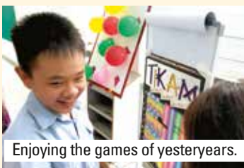
Enjoying the games of yesteryears.