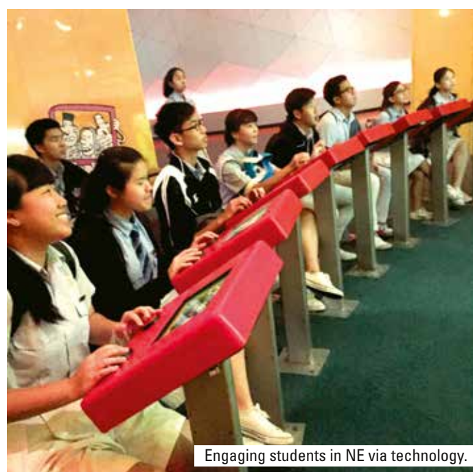
Engaging students in NE via technology.