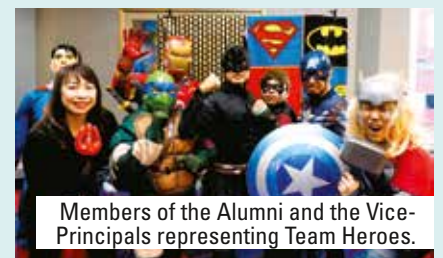
Members of the Alumni and the Vice-Principals representing Team Heroes.