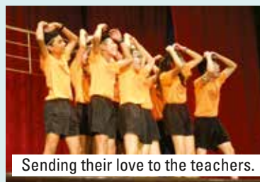
Sending their love to the teachers.