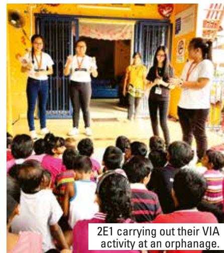
2E1 carrying out their VIA activity at an orphanage.

The school organised an Educational and Values In Action (VIA) Trip to Malacca for the Secondary Two students during the September holidays. The trip was organised as part of the overseas educational exposure and internationalisation programme. It aimed to widen the students' exposure to different cultures and provide opportunities for them to participate in a VIA activity at an orphanage or a primary school in Malacca.