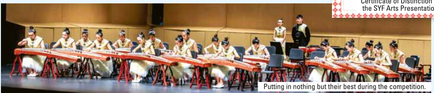
Putting in nothing but their best during the competition.