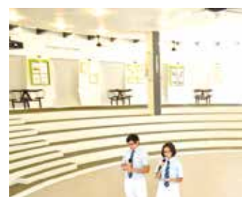
Presenting their opinions during the Student Voice talk.

Another empowerment platform, known as the Student Voice , is a talk held at the Amphitheatre every semester where the NE Ambassadors share their knowledge and views about the current issues which Singapore is facing.