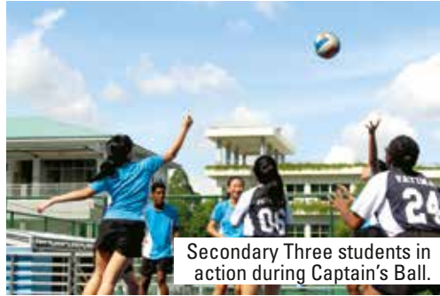
Secondary Three students in action during Captain's Ball.