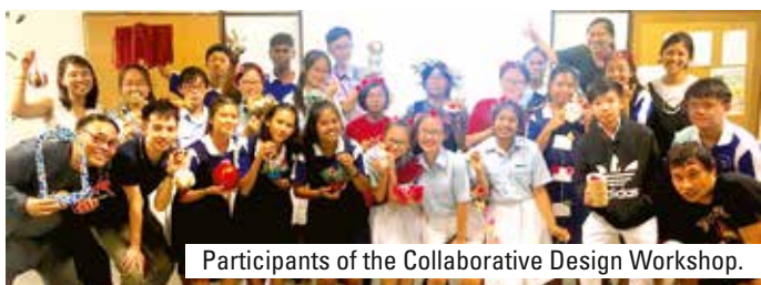
Participants of the Collaborative Design Workshop.