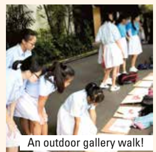
An outdoor gallery walk!

In order to develop Art students into independent learners who take ownership in their art exploration and making, the Art Unit included outdoor sketching sessions at The Metropolis as well as Gardens by the Bay as part of the Secondary Three Art Programme. The students learned to pack their own outdoor sketching materials, frame the subject matter and scenes, and have a better understanding of the various sketching materials. The students also gained confidence in their observation sketches through their experiences as well as the encouragement from public observers.