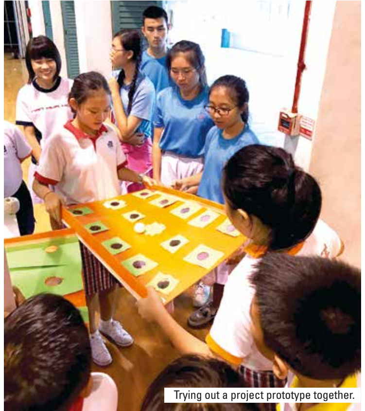
Trying out a project prototype together.