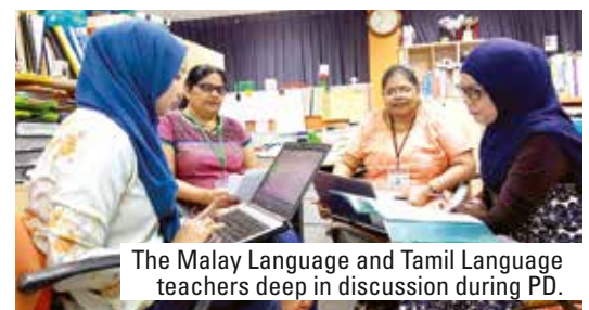
The Malay Language and Tamil Language teachers deep in discussion during PD.

The Chinese Language Unit organised a book sharing session for the Lower Secondary Higher Chinese Language students on 19 May. The session aimed to provide a platform for the students to hone their presentation skills, as well as to promote reading in the school. During the session, the students took turns to share book reviews and had the opportunity to recommend good reads to their peers and learn from one another.