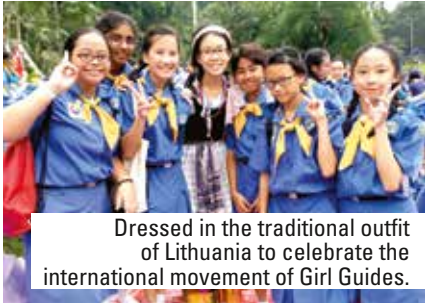
Dressed in the traditional outfit of Lithuania to celebrate the international movement of Girl Guides.