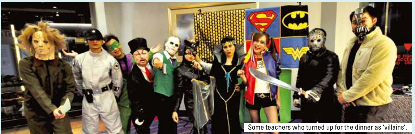
Some teachers who turned up for the dinner as 'villains'.