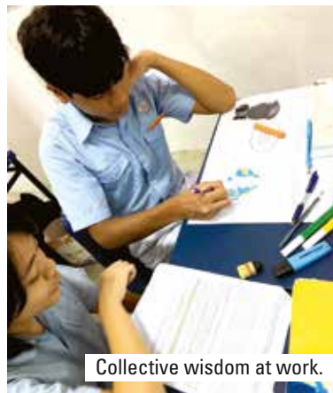
Collective wisdom at work.