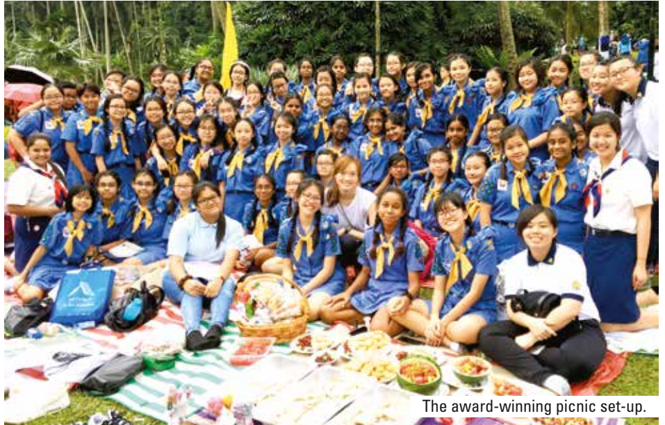
The award-winning picnic set-up.

2016 was a rewarding year for the Girl Guides who achieved the prestigious Puan Noor Aishah Gold Award in recognition of the unit's excellence for holistic achievement. Moving forward, the Girl Guides had 24 Secondary One recruits and 4 graduated seniors joining the unit in 2017. The recruits were enrolled in February and had the privilege of celebrating the 100 th anniversary of the guiding movement through a massive celebration at the Singapore Botanic Gardens. Through the guides' creativity and enthusiasm, the unit emerged first in the West Zone for the Most Creative Picnic Competition .