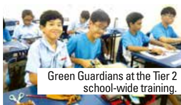
Green Guardians at the Tier 2 school-wide training.