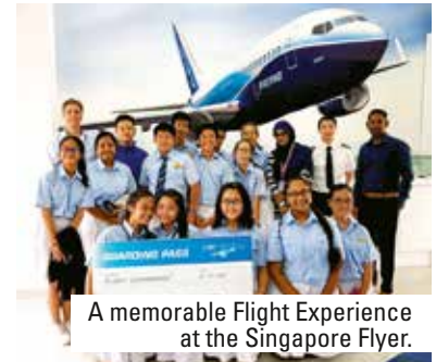
A memorable Flight Experience at the Singapore Flyer.