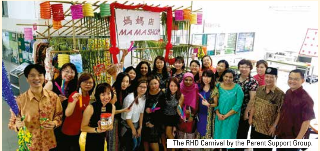
The RHD Carnival by the Parent Support Group.

Racial Harmony Day (RHD) was commemorated on 18 July during the assembly programme with a skit, The Singapore Way , to reiterate the importance of living with diversity and good neighbourliness. This was followed by the F.U.N. Concert which brought together students of different races through their common interest and passion in music. The school also celebrated its unity in diversity through a series of activities which included a cooking competition, The Singapore Way Cook-Off , and the Groom Your Classroom Competition .