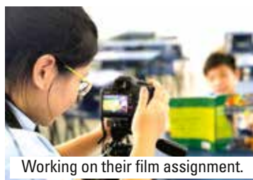
Working on their film assignment.