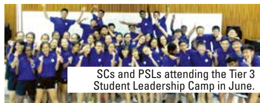
SCs and PSLs attending the Tier 3 Student Leadership Camp in June.

The school adopts a whole-school, integrative approach where every teacher is involved to develop the student leaders to achieve the following outcomes: