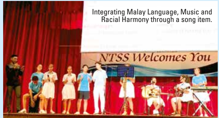
Integrating Malay Language, Music and Racial Harmony through a song item.

F ulfilling. U niting. eN gaging. – These concerts are platforms for Newtowners to develop their potential and skills for music expression. The Secondary One students had their very own F.U.N. Concert on 17 May, where representatives from every class showcased their learning from the music programme to their fellow schoolmates. The second F.U.N. Concert was held as part of the Racial Harmony Day commemoration. A group of Secondary Two and Three students, who share a similar passion in music, came together to put up a performance. The music teachers, ever so supportive, shared the stage with the students for the finale.