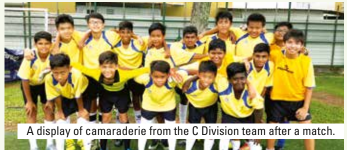
A display of camaraderie from the C Division team after a match.

On 14 February, the students in Football celebrated their entry into the inaugural School Premier League (SPL). The SPL is the equivalent of the National Football Competition for Secondary Schools and was introduced as a new format to provide greater competitive opportunities for participating schools. Amidst a rollercoaster group qualification phase, the B Division team showed great resilience in overcoming traditional powerhouses, staging last minute comebacks when pegged down initially. This allowed the team to eventually finish in second position, ensuring their passageway into the SPL – the first time in recent years that the team has qualified for a competition at the national level.