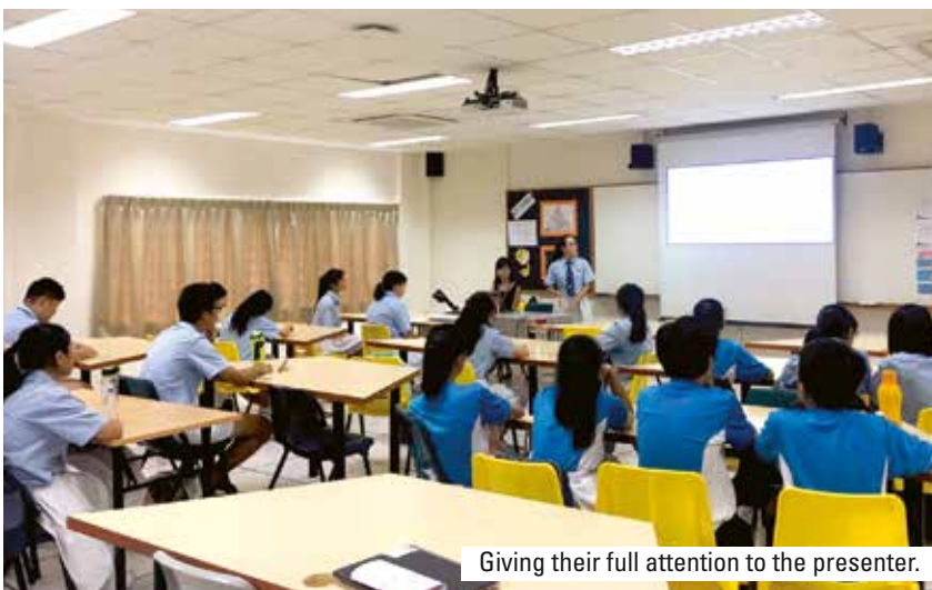
Giving their full attention to the presenter.