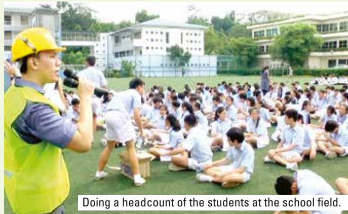
Doing a headcount of the students at the school field.

Exercise Rhino is a simulated exercise to help prepare the students and staff for evacuation and response procedures in the event of an actual emergency. It also helps to enhance the emergency preparedness of the school's Emergency Teams. Exercise Rhino is a realistic exercise which involves the Singapore Police Force, Singapore Civil Defence Force and Fire Department.