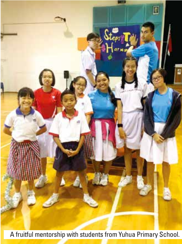
A fruitful mentorship with students from Yuhua Primary School.