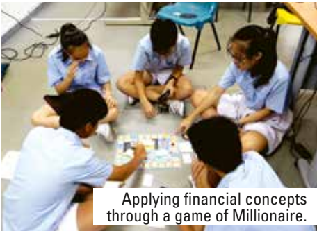
Applying financial concepts through a game of Millionaire.

During the June holidays, 14 students from 2N5 and 2N6 participated in a unique Elective Module to learn about business management in the aeronautics industry. The students were highly engaged as they created budgeting spreadsheets to track the expenditure incurred in the course of assembling their aeromodel artefacts. They even had the opportunity to test-fly these aeromodel artefacts! The rich learning culminated with a visit to the flight simulator at the Singapore Flyer where the students gained the rare experience of flying a plane simulator. They also interacted with a practising pilot who acted as their guide and trainer.