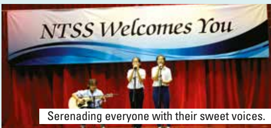
Serenading everyone with their sweet voices.

This year's Teachers' Day dinner was themed Heroes vs Villains , and the staff and guests turned up in different costumes, complete with props, ready to save or destroy the day. The ballroom was filled with cheers and laughter as heroes and villains fought each other, virtually of course, on the Nintendo Switch games of Wizard , Quick Draw , Boxing Game and Sword Fight . It was interesting to watch the usually mild-mannered colleagues wield their virtual swords to slay their opponents, and some of us learned how to throw a hook which has nothing to do with fishing. Team Heroes and Team Villains also fought with words, as they crafted stories of how they defeated each other using common teaching aids and with New Town Secondary School as their battle ground.