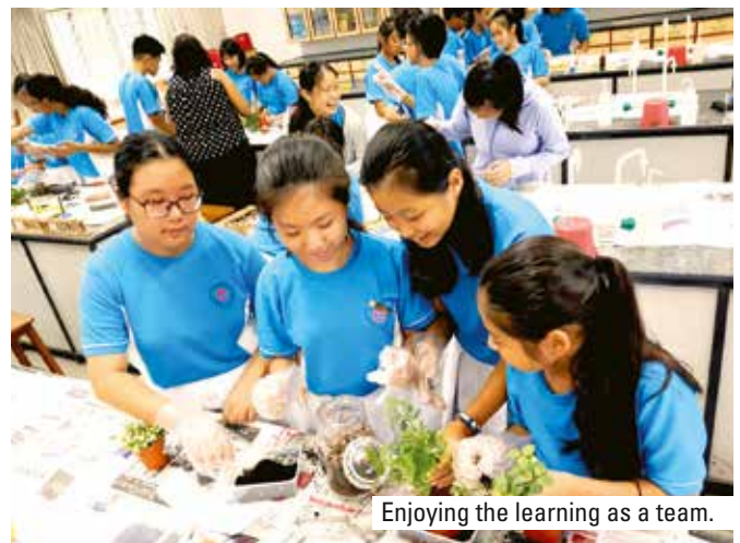
Enjoying the learning as a team.

In May, the Biology Unit conducted a Terrarium Making Workshop for the Secondary One students to complement the classroom lessons on the theme of 'Diversity'. The students worked in groups of four to create a natural living environment in a glass jar using a variety of mosses and other small plants. The terrarium was then used to investigate the factors that affect the survival of the flora and fauna in the miniature ecosystem.