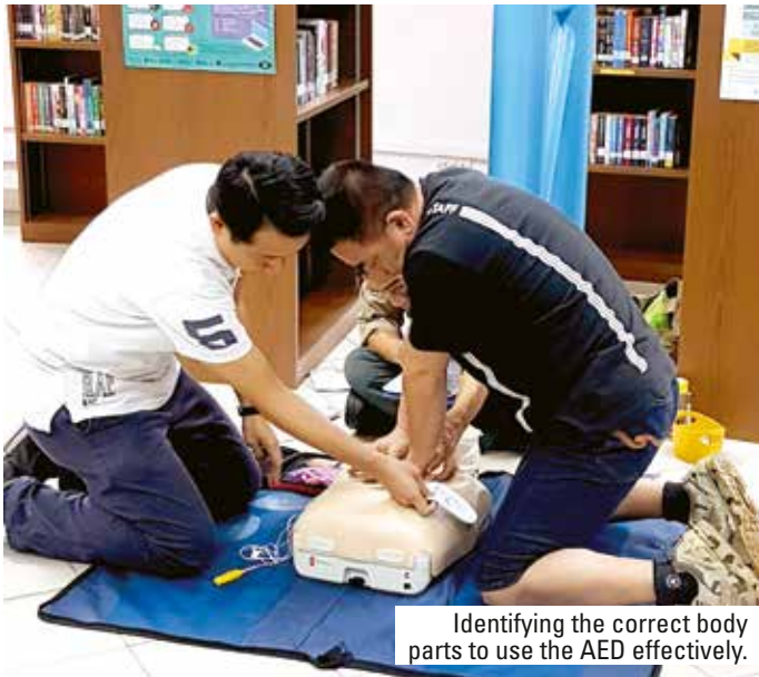
Identifying the correct body parts to use the AED effectively.