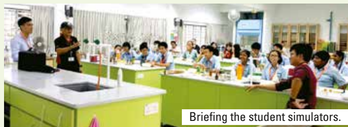
Briefing the student simulators.

As part of emergency preparedness, the school went through the School Emergency Training and Exercise (SEMTEX) conducted by the Ministry of Education in Semester 1. The SEMTEX culminated in Exercise Rhino which was held on 28 April.