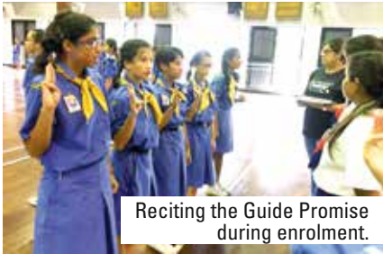
Reciting the Guide Promise during enrolment.