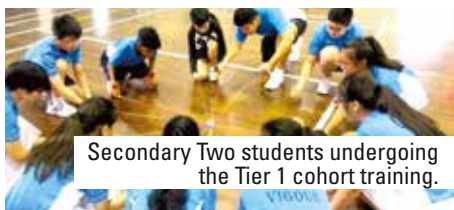
Secondary Two students undergoing the Tier 1 cohort training.