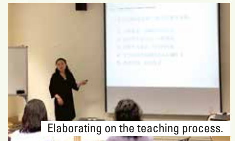
Elaborating on the teaching process.