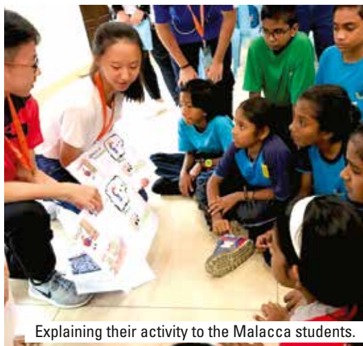
Explaining their activity to the Malacca students.