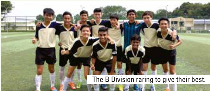
The B Division raring to give their best.