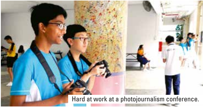
Hard at work at a photojournalism conference.