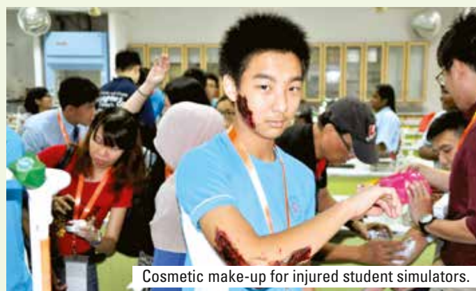
Cosmetic make-up for injured student simulators.