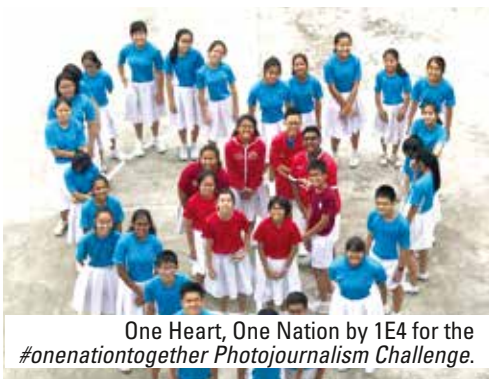
One Heart, One Nation by 1E4 for the #onenationtogether Photojournalism Challenge.