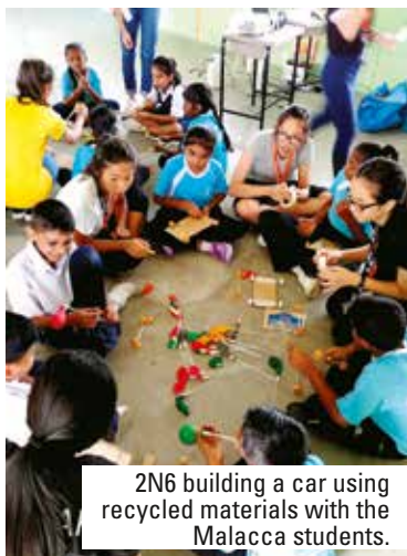
2N6 building a car using recycled materials with the Malacca students.