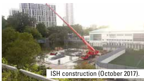
ISH construction (October 2017).