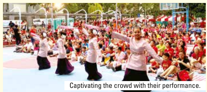
Captivating the crowd with their performance.

The People's Association invited the school to be a part of their National Day Observance Ceremony at the Clementi Community Centre. The Ethnic Fusion Dance Group enthralled the crowd with their graceful dance steps. The dance symbolised racial diversity in harmony, aptly conveyed by the Newtowners from the various races dancing to the same tune. During their free time, the students visited the numerous stalls at the fun fair and took in the lively carnival atmosphere. It was an exuberant celebration befitting the nation's 52 nd birthday!