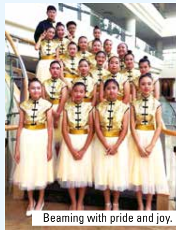
Beaming with pride and joy.

This enriching journey has moulded the Guzheng Ensemble to stay united and motivated, aim for excellence and put up a good performance for the audience. The memories made will be treasured by the students even after graduating from the school.