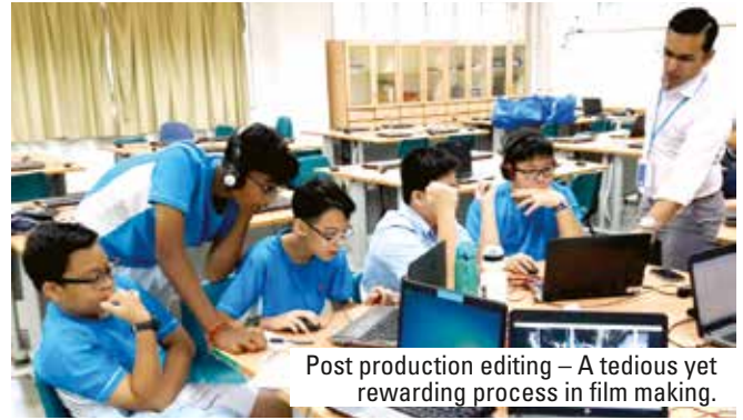
Post production editing – A tedious yet rewarding process in film making.

The Infocomm Club had an eventful year working to re-align its goals and programmes to support the school's Applied Learning Programme in visual communication. The students took part in the annual Voice Up! Challenge organised by the Ministry of Education, Centre of Excellence for Digital Media. The original film produced, From Keyboard Warriors to Haze Fighters , clinched the third prize out of 132 entries. Six other teams also represented the school in the prestigious Singapore Digital Media Awards . From brainstorming of ideas and story boarding to outdoor filming and post production work, the students applied their academic knowledge and skills in the real world context.