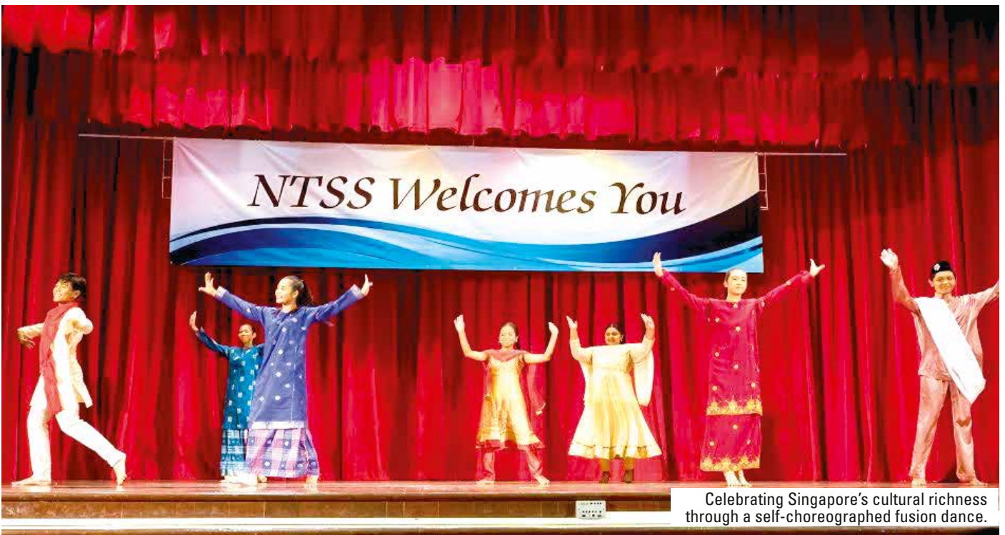
Celebrating Singapore's cultural richness through a self-choreographed fusion dance.

National Education (NE) for Newtowners has always been linked to cultivating heartware and rootedness to Singapore. With the contemporary challenge in engaging students in NE today, NE has moved beyond raising the level of awareness and appreciation of Singapore, to empowering the students. That is to say, more opportunities have been created, not