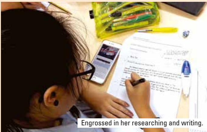
Engrossed in her researching and writing.

The anthology of the students' essays was printed and distributed to all the Secondary Three students. It was undoubtedly a rewarding experience for the participants to see their ideas come to fruition.