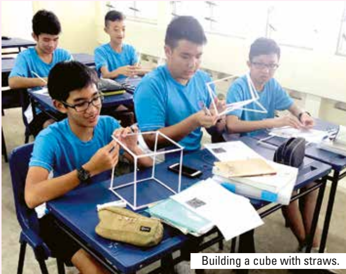
Building a cube with straws.