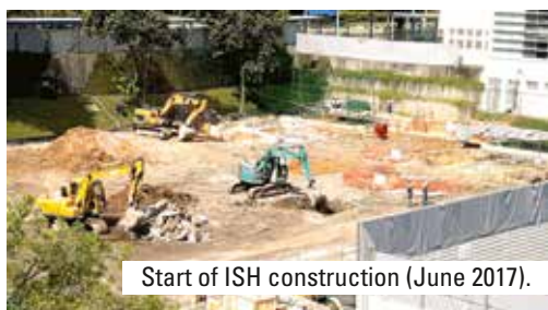
Start of ISH construction (June 2017).