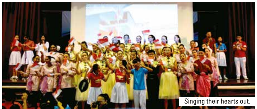
Singing their hearts out.

On 8 August, the school celebrated Singapore's 52 nd birthday firstly with a specially planned Character and Citizenship Education lesson. The students were challenged to express their interpretations of being one nation together through the #onenationtogether Photojournalism Challenge . Many entries expressed heartfelt sentiments, demonstrating loyalty to the nation and unity within the nation regardless of race, language or religion.