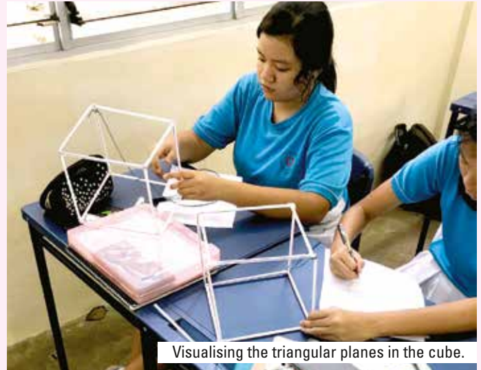
Visualising the triangular planes in the cube.

The visualisation of 3-dimensional models has always been a challenge to the students. Hence, the Mathematics Department designed a hands-on activity to enable the students to manage it. The Secondary Three students were engaged in building a 3-dimensional cube using straws. They used the model to visualise different triangular planes in a cube and learn about solving various problems. The students gained a greater understanding of 3-dimensional models and were more confident in solving similar problems.