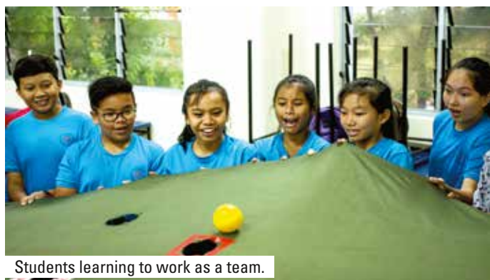
Students learning to work as a team.

The school believes that every student can be developed as a leader and the school's progressive leadership structure allows the students to take charge of their own leadership journey. Through a whole-school approach, every student is given equal opportunities to be developed so as to achieve the Community and Youth Leadership outcome of Developing Confident and Compassionate Student Leaders to Lead, Serve and Excel .