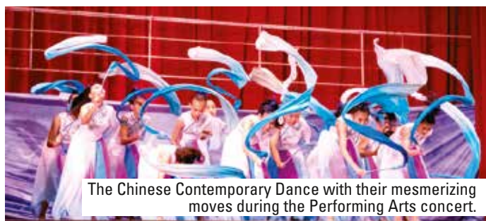
The Chinese Contemporary Dance with their mesmerizing moves during the Performing Arts concert.

them to find out more about all the CCAs available in the school by interacting with their seniors and teachers-in-charge of the various CCAs. Through such interaction and guidance, it helped the Secondary Ones gain confidence in choosing CCAs which interest them and will help nurture them to their fullest potential.