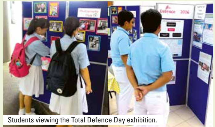
Students viewing the Total Defence Day exhibition.

During the Character and Citizenship Education (CCE) lesson, the national pledge was discussed to deepen the students' understanding of social cohesion in Singapore. This was followed by an assembly talk on how Total Defence has provided a united and integrated response to the challenges faced by Singapore. Students from the various Uniformed Groups were also invited to share about the roles they have played to support Total Defence. There was also a quiz to help the students learn about Total Defence through fun and excitement. The school then sang the Total Defence Day song, There's A Part For Everyone , as a finale.