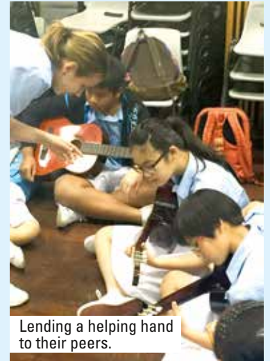
Lending a helping hand to their peers.

Every week, the Secondary One students take on the challenge of playing an instrument that is familiar but yet distant to many – the guitar. The students would learn to read the guitar chord tabs and also learn to play the guitar with different strumming patterns. Through guidance from both their music teacher and peers, these students would eventually put up a performance in their groups to present a song item of their choice to their class.