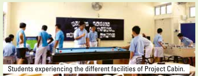
Students experiencing the different facilities of Project Cabin.

After a year of closure, with a brand new location and a fresh new look, the school's Project Cabin finally re-opened in March 2016 to the excitement of the students and staff alike.