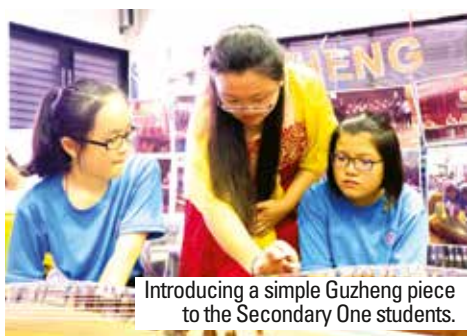
Introducing a simple Guzheng piece to the Secondary One students.

On 15 January 2016, the school premises was abuzz with activities as the various CCA groups showcased their achievements and talents at their CCA booths. The CCA Open House officially started