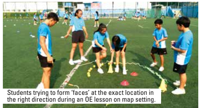
Students trying to form 'faces' at the exact location in the right direction during an OE lesson on map setting.

The module continues to equip the students with more advanced orienteering skills through activities such as relay orienteering in Secondary One and compass reading in Secondary Two. The Secondary Three students will then be able to apply the skills and knowledge taught during the Secondary Three Camp when they are challenged to navigate and get from one location to the next using the equipment provided.