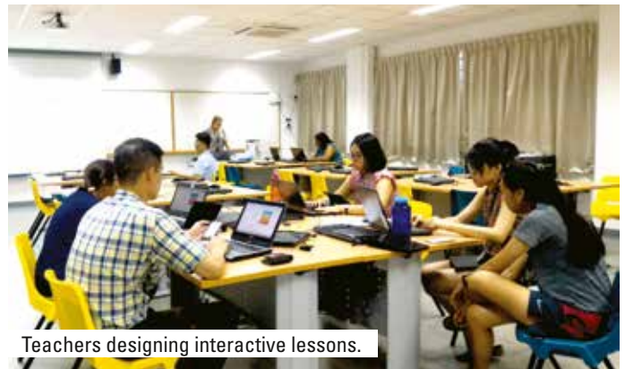
Teachers designing interactive lessons.

In this age of digital learners, there is a rise in the importance of ICT in the classroom. As such, the ICT Coffeeshop Talks hope to inspire and encourage the teaching staff to keep learning and to stay current for the students.