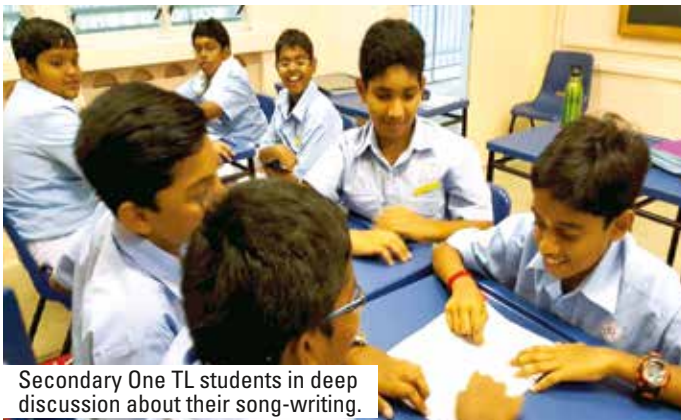
Secondary One TL students in deep discussion about their song-writing.

No doubt, the students had a lot of fun while letting their creative juices flow!