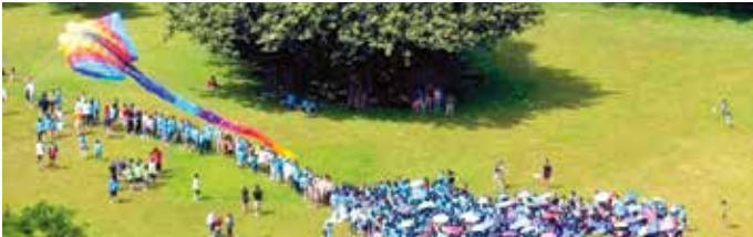
An aerial view of the largest human kite formation.

Prior to the event, the students attended awareness talks by DSA and activities such as poster-making and windmill-making. After the event, the students wrote reflections to consolidate their learning.