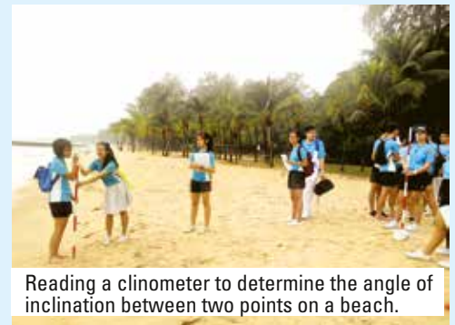
Reading a clinometer to determine the angle of inclination between two points on a beach.