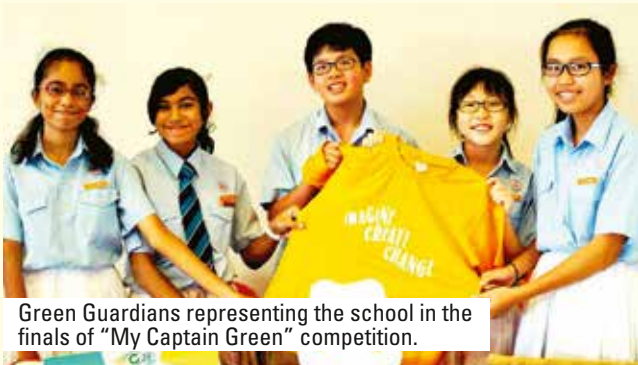
Green Guardians representing the school in the finals of "My Captain Green" competition.