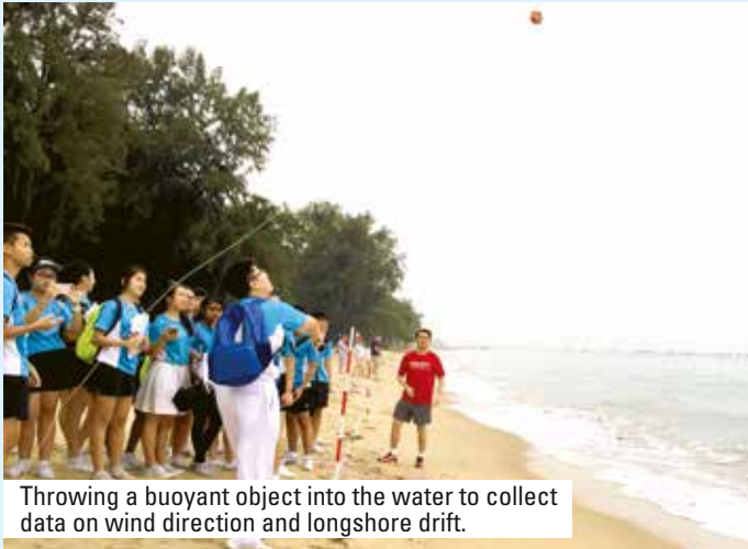
Throwing a buoyant object into the water to collect data on wind direction and longshore drift.

On 19 and 20 February 2016, the school's Geography teachers led the Secondary Three Full Geography students to conduct a Geographical Investigation (GI) of the coast at East Coast Park. GI is an integral component of the new Inquiry-Based Learning adopted under the revised Geography syllabus.