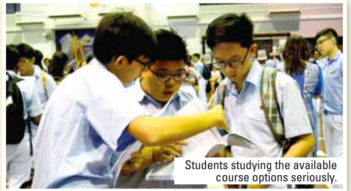
Students studying the available course options seriously.

17 December 2015 and 11 January 2016 were days of great anticipation for the 2015 Secondary Four and Five students. Many of them made their way to school as early as noon, eagerly awaiting the release of the GCE Examination results. It has been a while since they last donned the school uniform and entered the school premises, and the rush of fond memories as they did so must have been moving.