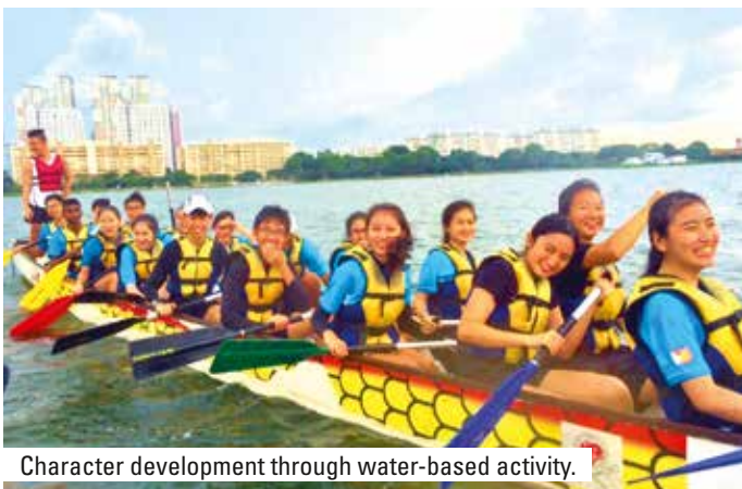
Character development through water-based activity.

Community and Youth Leadership , the school's Learning for Life Programme, focuses on building the character and leadership potential of the students. Guided by the Student Leadership Framework, Community and Youth Leadership provides character and leadership development for the students through the following level-wide programmes.