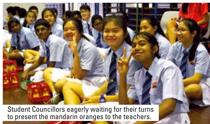
Student Councillors eagerly waiting for their turns to present the mandarin oranges to the teachers.

The Lion Dance was, as always, the highlight of the concert. The friendly and mischievous Lion mingled with the audience, engaging them at every turn. The students and staff were also excited to see the God of Fortune entering the school hall with the auspicious Lion.