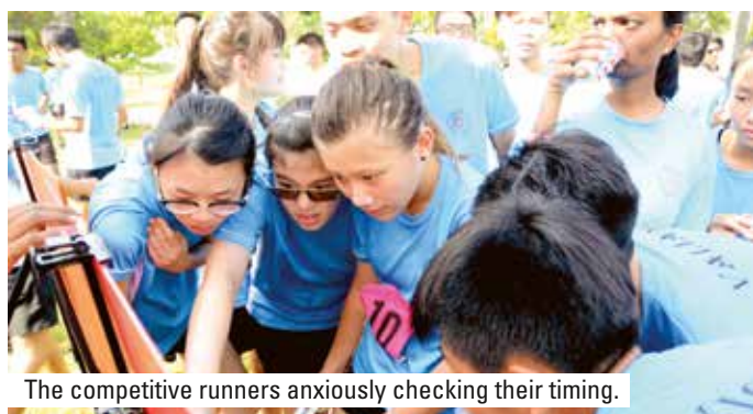
The competitive runners anxiously checking their timing.

mangroves. Everyone's spirits were lifted as competitive runners pushed themselves to their limits during the race and students who were not running cheered for their friends at the finishing line. It was a valuable opportunity for students to forge new friendships and deepen existing ones. Joining the cross-country's fun run were also members of the Alumni and Parent Support Group (PSG).