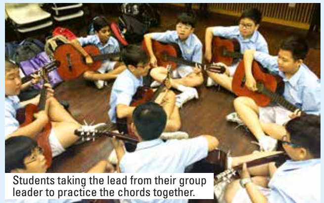
Students taking the lead from their group leader to practice the chords together.

Other than learning how to play the guitar, students travelled through music to different countries all over the world to learn about different string instruments. The students displayed appreciation of the different cultures and their music when they learnt how the different instruments and playing techniques attributed to the musical style of the country.