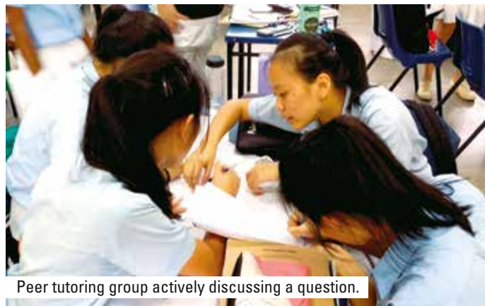
Peer tutoring group actively discussing a question.