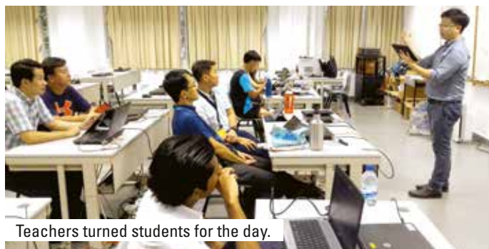
Teachers turned students for the day.