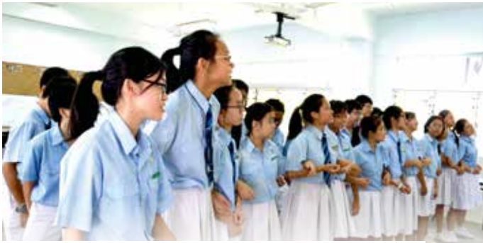
Secondary Two CL students during the sing-along session.

During the Mother Tongue Fortnight, the Secondary One and Two students embarked on a short but enriching journey into the world of music.