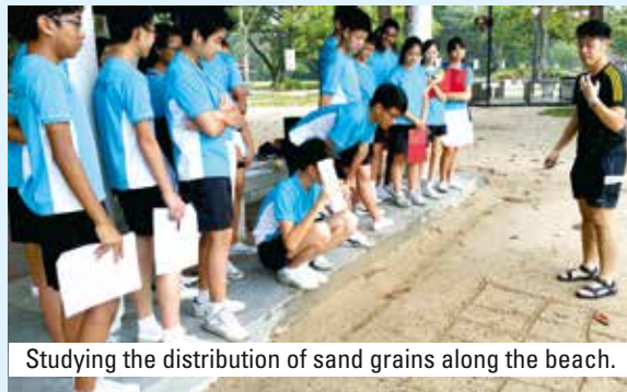
Studying the distribution of sand grains along the beach.