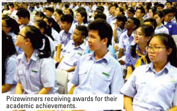
Prizewinners receiving awards for their academic achievements.