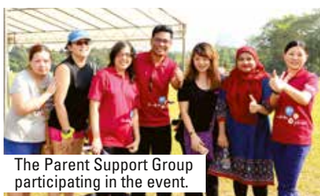
The Parent Support Group participating in the event.

The students also competed by representing their Co-Curricular Activities (CCA). The school congratulates the top 25 runners from the Upper and Lower Secondary boys' and girls' races, as well as the girls' Basketball team and the boys' Football team for coming in first for the inter-CCA challenge trophy respectively.