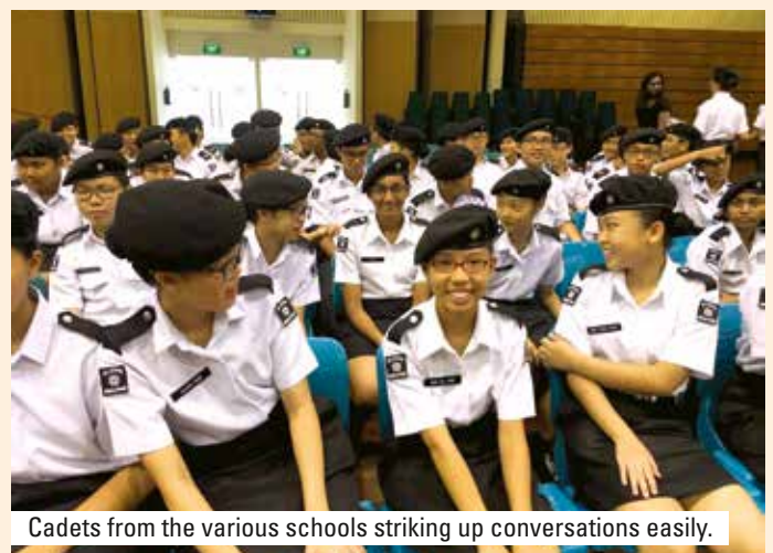
Cadets from the various schools striking up conversations easily.

The teacher-in-charge and the corp officers attended the ceremony to lend their support and to congratulate the newly-promoted cadets.