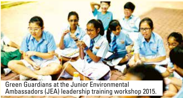
Green Guardians at the Junior Environmental Ambassadors (JEA) leadership training workshop 2015.

For three consecutive years, from 2013 to 2015, the school has achieved the Gold Award for Green Schools @ South West. The school would like to congratulate and thank the Green Guardians who have worked hard and contributed much to the Green School programme. The Green Guardians have played the role of environmental champions in raising awareness for environmental issues in the school as well as served the community through self-initiated environmental campaigns.