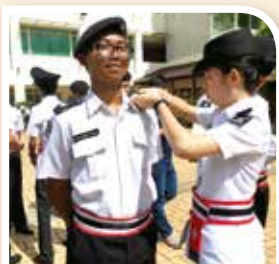
The Corp officer putting on the rank for the cadet.

On 23 January 2016, six of the school's deserving cadets attended the 20th Advance NCO Course and 38th Standard NCO Course Passing Out Parade held in Chung Cheng High School (Yishun). The parade not only signified their resilience to overcome the rigours of the course, but it also marked a significant milestone for these cadets to prepare them for their leadership roles and responsibilities in St John Ambulance Brigade.