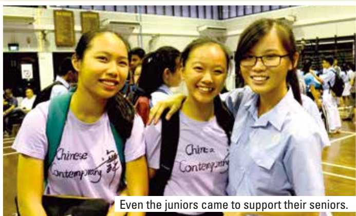
Even the juniors came to support their seniors.

As the saying goes, the man who graduates today and stops learning tomorrow is uneducated the day after. The school is proud of the Class of 2015, and hopes that the spirit of lifelong learning will stand them in good stead for the years to come.