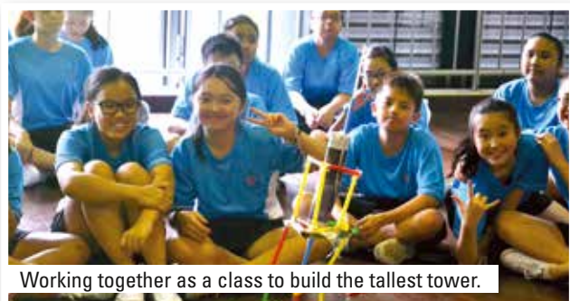
Working together as a class to build the tallest tower.

4 January 2016 marked the start of an exciting journey through secondary school life for the new batch of Secondary One students.