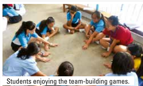
Students enjoying the team-building games.