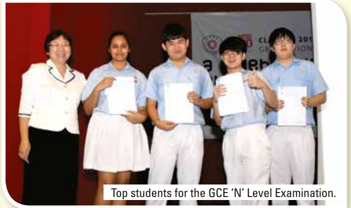
Top students for the GCE 'N' Level Examination.

17 December 2015 and 11 January 2016 were days of great anticipation for the 2015 Secondary Four and Five students. Many of them made their way to school as early as noon, eagerly awaiting the release of the GCE Examination results. It has been a while since they last donned the school uniform and entered the school premises, and the rush of fond memories as they did so must have been moving.