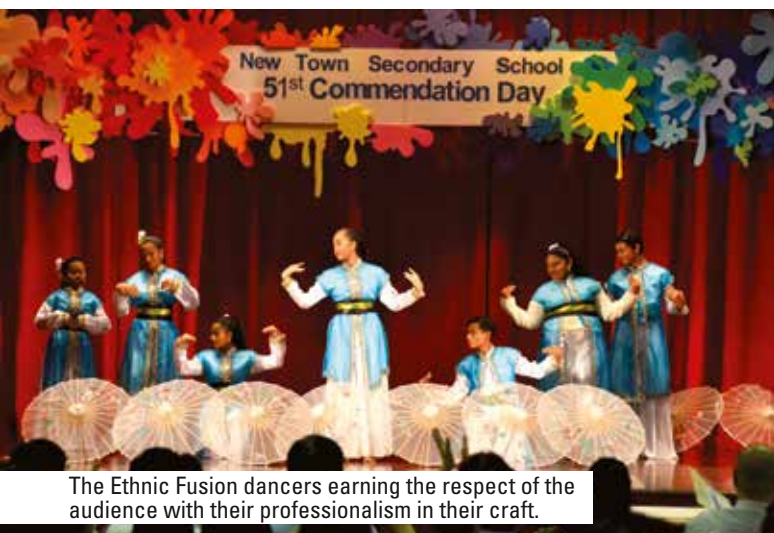
The Ethnic Fusion dancers earning the respect of the audience with their professionalism in their craft.