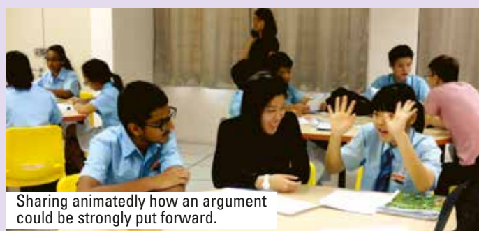
Sharing animatedly how an argument could be strongly put forward.

After exposing the student mentees to articles and discussions pertaining to the structures of expository texts, the USP mentors will then work closely with each of their mentees to produce a polished expository essay at the end of the programme. In these four sessions, the mentors take their mentees through the processes of brainstorming, planning, researching for evidence, writing the essay, and finally refining the essay. Throughout the mentorship, besides delivering the final essay, the programme also hopes to inspire the students in their educational aspirations and character.