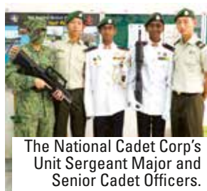
The National Cadet Corp's Unit Sergeant Major and Senior Cadet Officers.