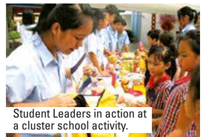
Student Leaders in action at a cluster school activity.

The school believes that every student can be developed as a leader and the school's progressive leadership structure allows the students to take charge of their own leadership journey. Through a whole-school approach, every student is given equal opportunities to be developed so as to achieve the Community and Youth Leadership outcome of Developing Confident and Compassionate Student Leaders to Lead, Serve and Excel .