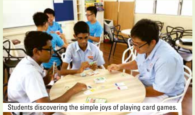
Students discovering the simple joys of playing card games.