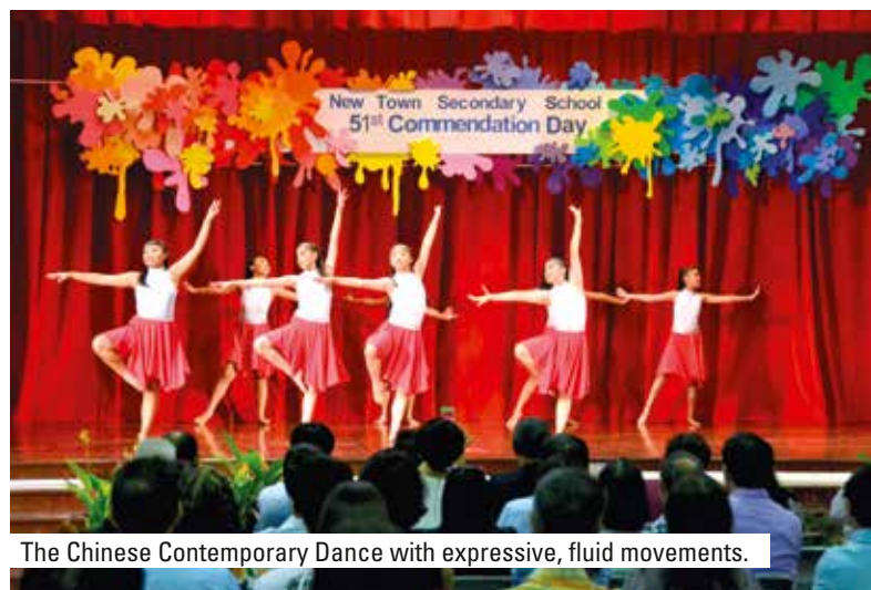
The Chinese Contemporary Dance with expressive, fluid movements.