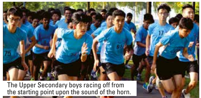
The Upper Secondary boys racing off from the starting point upon the sound of the horn.

On a cool morning, the school assembled at the Grand Lawn before the start of the race. The students ran through a scenic route past the western coastline and