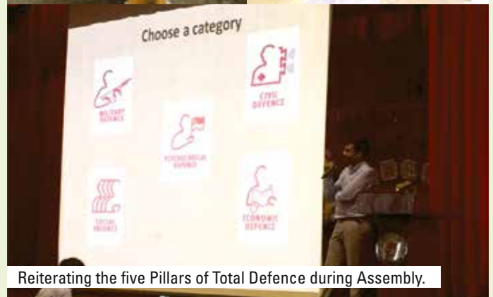
Reiterating the five Pillars of Total Defence during Assembly.