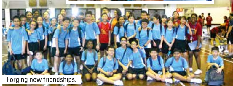
Forging new friendships.