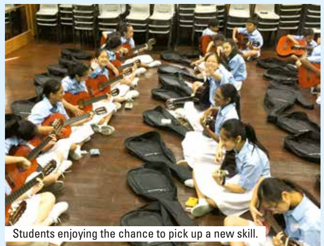
Students enjoying the chance to pick up a new skill.