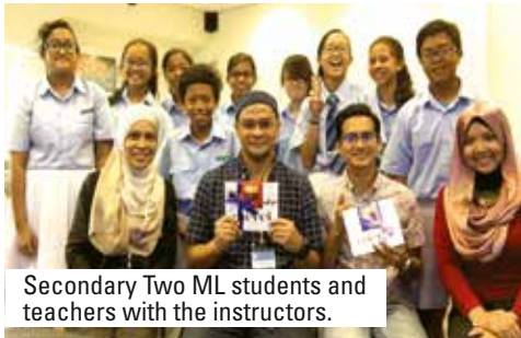
Secondary Two ML students and teachers with the instructors.

The Chinese Language (CL) students gained an understanding of the Xinyao songs (Singapore Chinese folk songs) popular in the 1970s and 1980s through a sing-along workshop. These budding song writers were also given the opportunity to re-write the lyrics and perform their own creations.