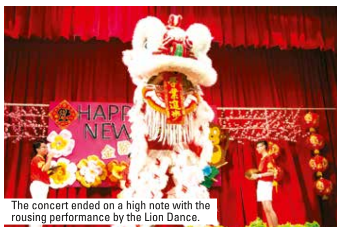
The concert ended on a high note with the rousing performance by the Lion Dance.