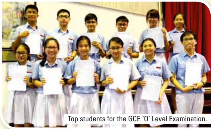
Top students for the GCE 'O' Level Examination.