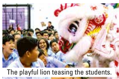
The playful lion teasing the students.