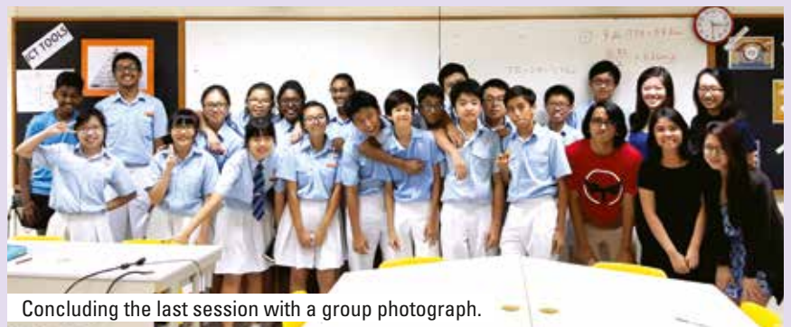
Concluding the last session with a group photograph.

Founded in 2013 by a group of University Scholar Programme (USP) students from the National University of Singapore (NUS), think! was conceived as an academic stretch programme designed to impart writing and critical thinking skills to selected Secondary Three Express students with relatively strong command of the English Language. think! aims to expose the students to issues beyond their classrooms and provide them the opportunity to hone their expository writing skills.