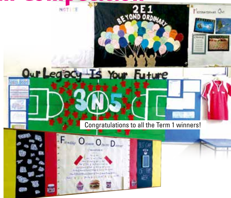
Congratulations to all the Term 1 winners!