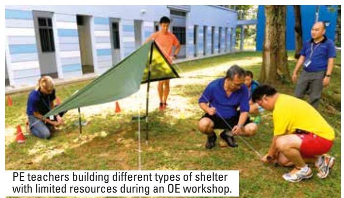
PE teachers building different types of shelter with limited resources during an OE workshop.