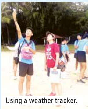
Using a weather tracker.

Armed with equipment such as clinometers, measuring tapes and ranging poles, the students conducted three sets of on-site activities with the objective of testing a hypothesis they formulated during the pre-field preparation stage. Rising to the challenge, the students successfully completed their investigation by collecting useful data on parameters such as beach profile and wave speed. The experience has certainly helped the students to appreciate the investigative aspects of learning Geography.