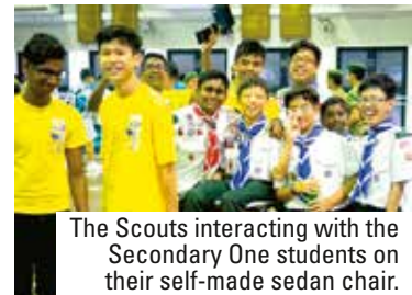
The Scouts interacting with the Secondary One students on their self-made sedan chair.