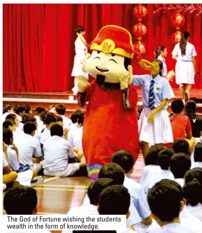
The God of Fortune wishing the students wealth in the form of knowledge.