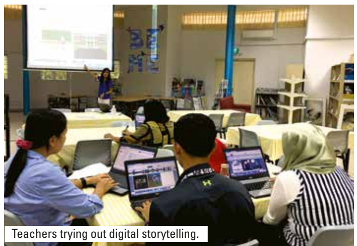
Teachers trying out digital storytelling.