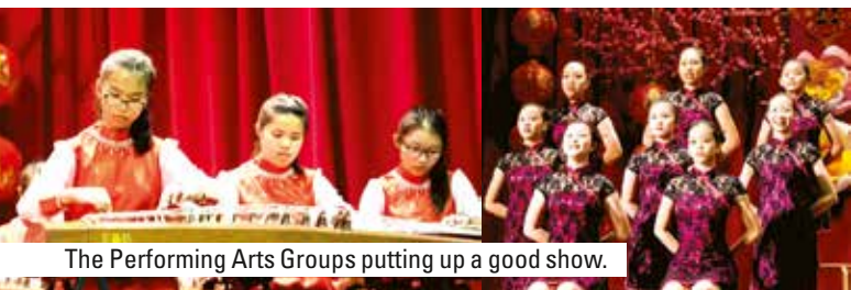
The Performing Arts Groups putting up a good show.