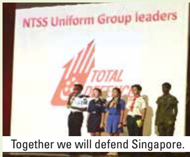
Together we will defend Singapore.

In conjunction with this year's Total Defence Day theme, Together We Keep Singapore Strong , the school commemorated Total Defence Day through a diverse range of activities. One of these was the Total Defence Day exhibition involving the Secondary Four National Education (NE) Ambassadors.