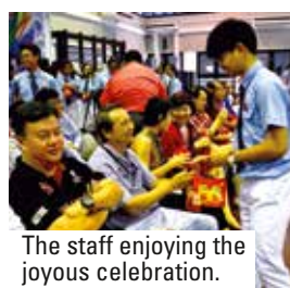
The staff enjoying the joyous celebration.