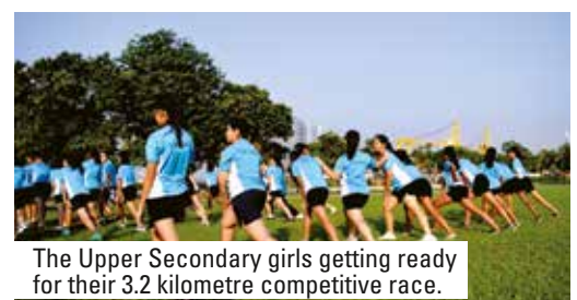
The Upper Secondary girls getting ready for their 3.2 kilometre competitive race.