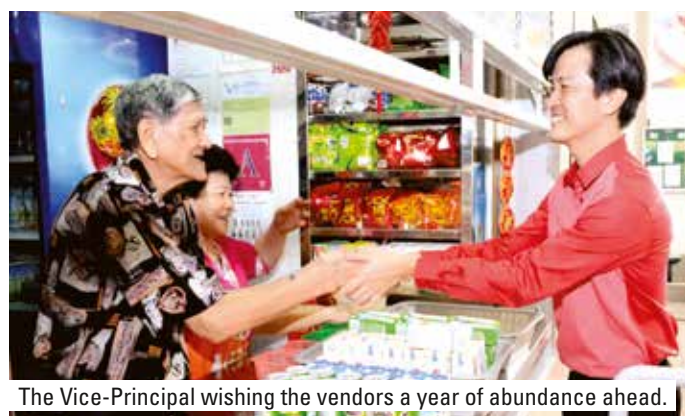
The Vice-Principal wishing the vendors a year of abundance ahead.