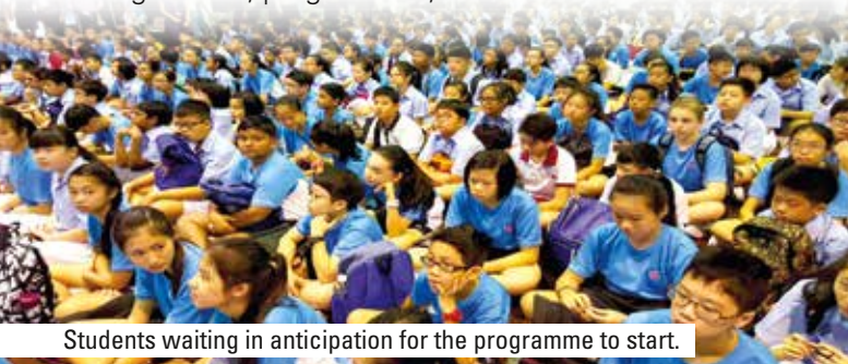
Students waiting in anticipation for the programme to start.

The school held the Secondary One Orientation Camp from 4 to 6 January 2016 to help the students adjust to secondary school life, as well as to get to know their classmates and teachers. It was also to familiarise the students with the school environment, policies, rules and regulations, programmes, and the Co-Curricular Activities.