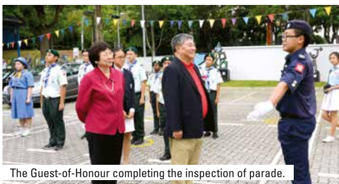
The Guest-of-Honour completing the inspection of parade.