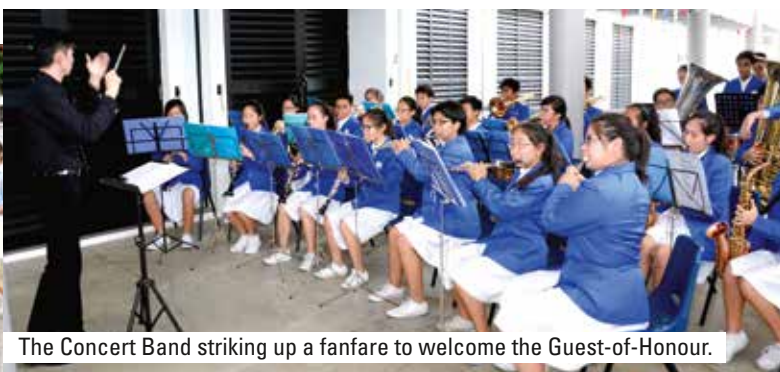
The Concert Band striking up a fanfare to welcome the Guest-of-Honour.