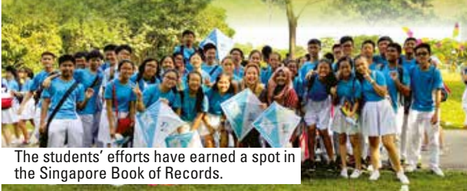
The students' efforts have earned a spot in the Singapore Book of Records.